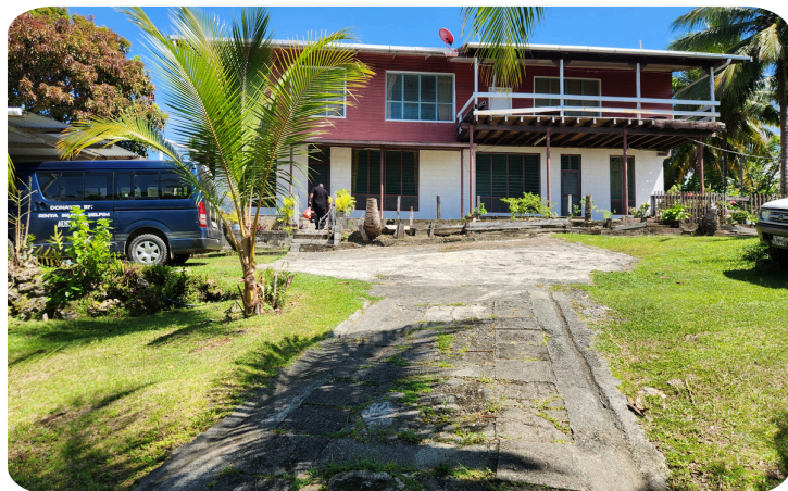
The Passionist House in Tovv.