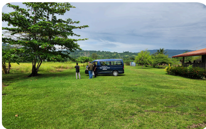
The site for the New Senta Belong Helpim in Vanimo.