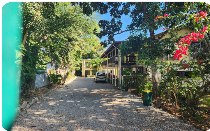
St Gabriel's Retreat in Port Moresby