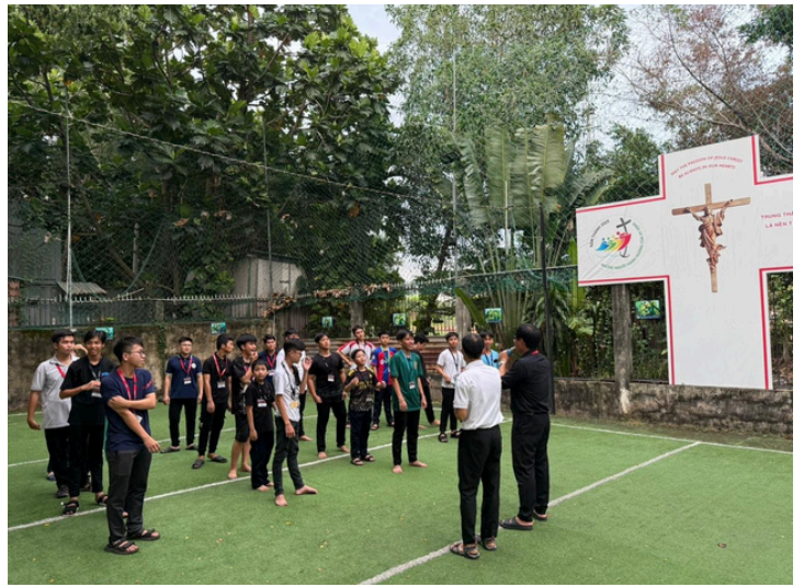
Photos from Vocation Day.