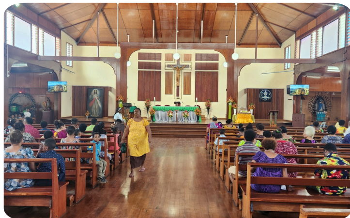
St. Joseph's Church in Port Moresby.