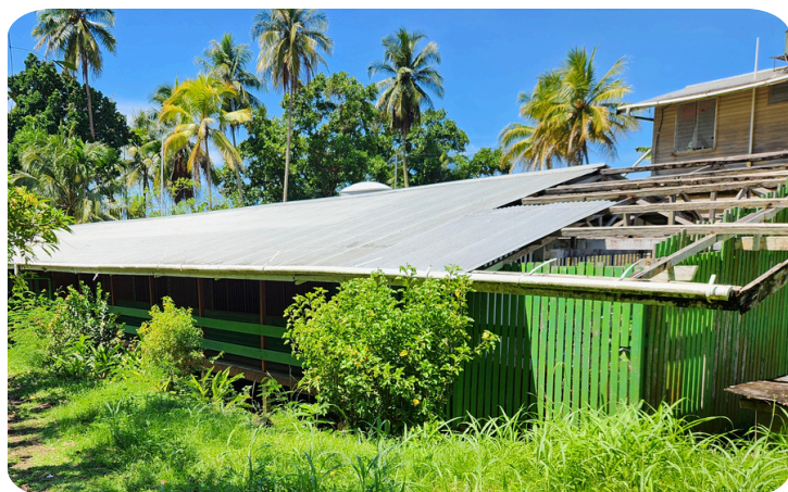
The Senta Belong Helpim in Warimo.