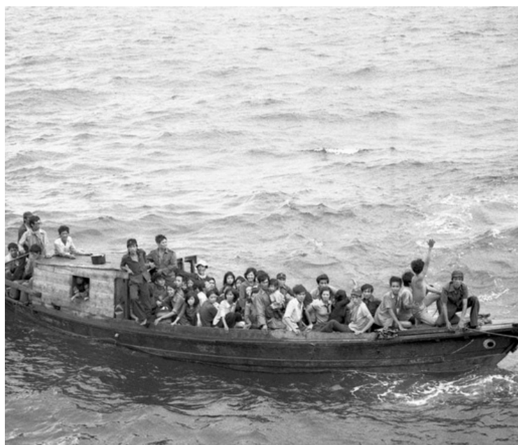
30th of April 1975, the arrival of the first Vietnamese refugee boat people in SA.