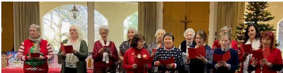
Members of Christ the King's Ladies Guild sing Christmas carols for the guests during the Christmas luncheon.