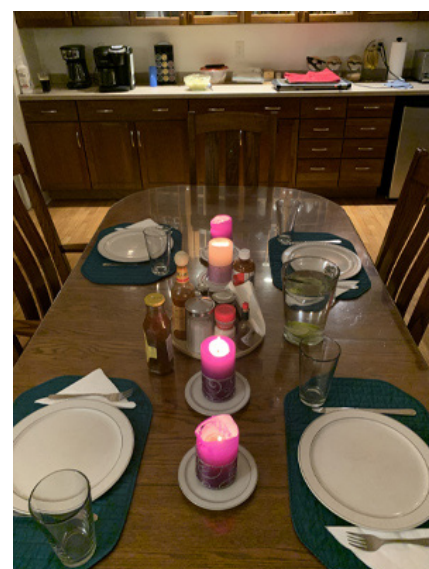
A lovely Christmas table setting.