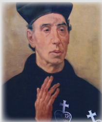
St. Charles of Mount Argus