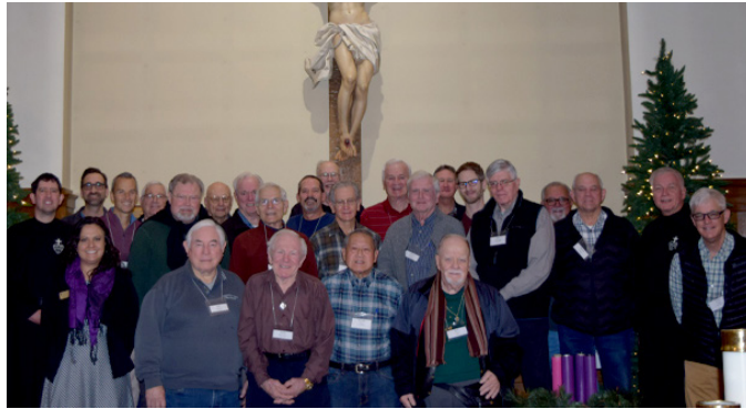
The Men's Weekend Retreat was well-attended.

December was busy with holiday celebrations at the retreat center. The month began with the first Men's Weekend Retreat. The Men's and Women's Retreat Weekends will resume in January, continuing through April.