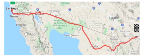
Map of the race from San Diego, California to Agua Prieta, Mexico.