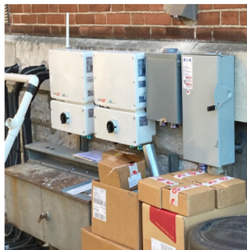
Installation of the batteries and switching gear is complete in preparation for the solar panels.