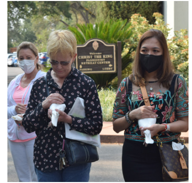
Healing Mass participants preparing for the release of doves.