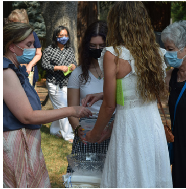
Washing of hands followed the Healing Mass.