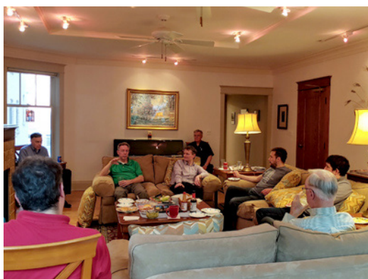
A little social time before dinner.