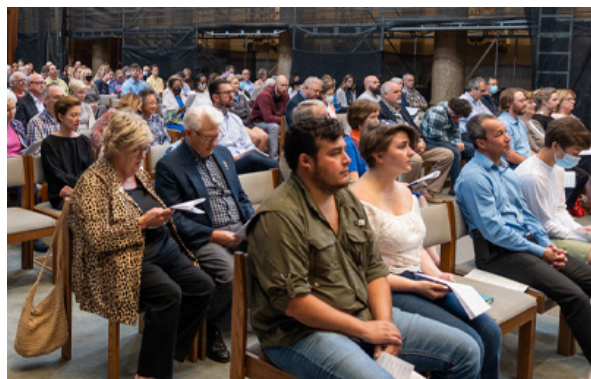
The Cathedral was filled for the special Mass.