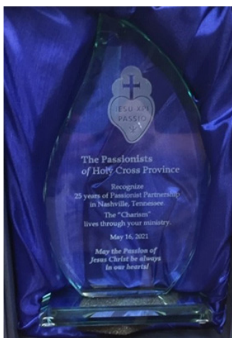
The award presented to the Nashville CPPs.

May the Passion of Jesus Christ be always in our hearts!