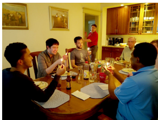
Everyone got their own candle to blow out.