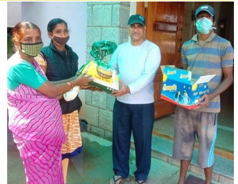
THOM Vice-Province, Covid-19 Relief Works... Carmelaram Community initiates distribution of food items to the neighboring poor families (Above) Kochi community distributes medical aids through the Local Police. (Below)