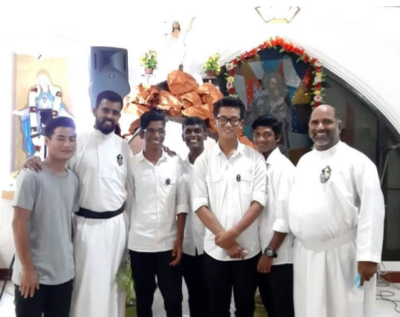
Easter Celebration At Kochi Community