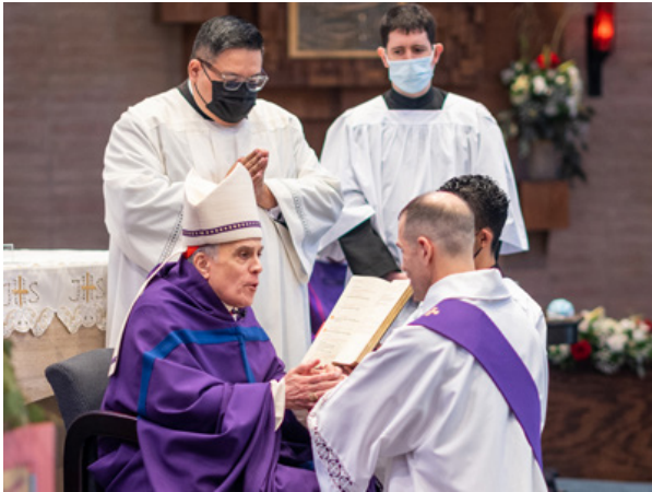
Cardinal DiNardo during the rite of anointing of the priest's hands.

More pictures are available on our website .