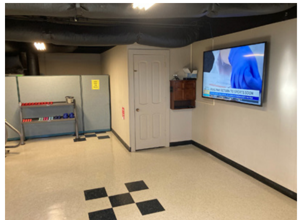
The TV and computer station allow for a second Zoom studio. Each week, Lisa, the community's trainer, leads the men in exercise class via Zoom.