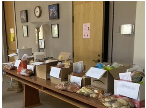
Christmas food for families staging area.