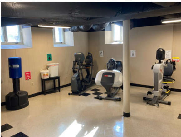
The equipment is set up in the new Sacred Heart Fitness Center, formerly known as the monastery basement.