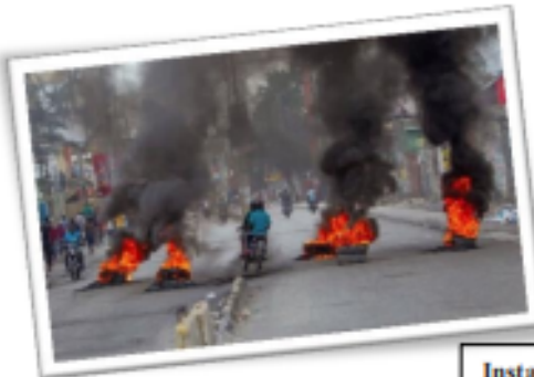
Instalan barricadas con llantas en llamas en lugares estratégicos de la capital, Puerto Príncipe, ya que las oposiciones exigen la salida del actual gobierno.

Durante 2020, el país experimentó una rápida depreciación de la moneda y una inflación galopante. El dólar estadounidense perdió el 40 por ciento de su valor en el país. No se rebajó el precio de la gasolina, el diésel y los alimentos