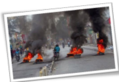
Barricades with burning tires are set up in strategic places of the Capital, Port-au-Prince as the oppositions demand the ousting of the current government.

Although I take all the necessary precautions, I feel afraid of being robbed or kidnaped. However, the thought of leaving Haiti has not crossed my mind. I do not feel emboldened, that is not who I am. I wrestle with my fear and try to overcome it every day. I feel a sense of duty to continue to be present to the dozen families we serve even if the circumstances seem so bleak. I have to take the risk to continue planting out of season. I just have to do it with more care for my life, the life of those we serve, and with deep reverence to life and its goodness, just like I have been doing with my nopales.