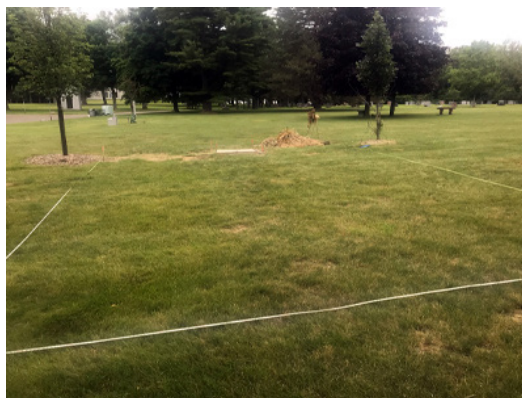
The Passionist plot at Holy Sepulchre.