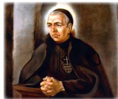
Blessed Dominic Barberi, CP