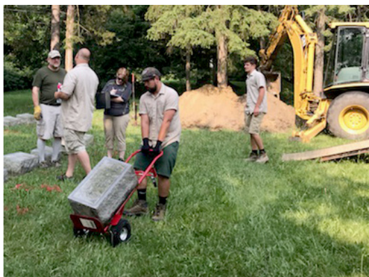
Crews remove a headstone from the Passionist cemetery for transport to Holy Sepulchre Cemetery.