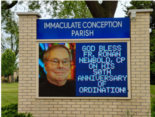
Parish sign in front of church.