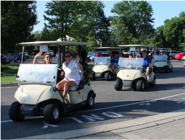
Off they go!

On Wednesday, July 24, St. Paul of the Cross Passionist Retreat and Conference Center in Detroit, Michigan, held its 33rd Annual Golf Classic. More than 110 golfers participated at Fellows Creek Golf Club in Canton, Michigan. Congratulations to all of the raffle winners! Many thanks to all of the participants, St. Paul's Golf Committee and all who worked tirelessly to make the day a success!