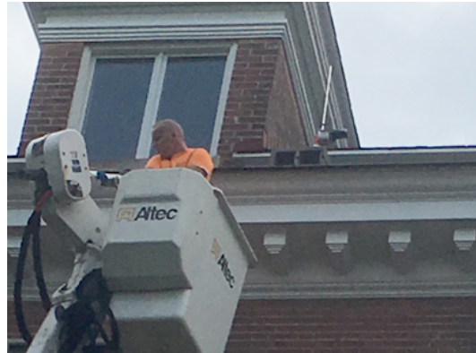
A worker installs the “gutter cam” on to Sacred Heart Monastery.