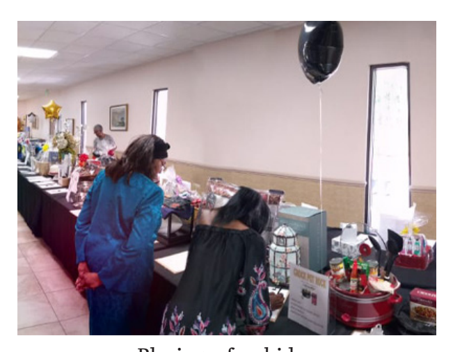
Placing a few bids.