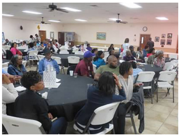
A great crowd turned out to help support the school.