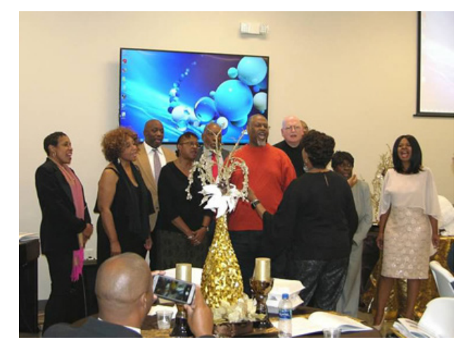
St. Mary's Choir provided wonderful entertainment.