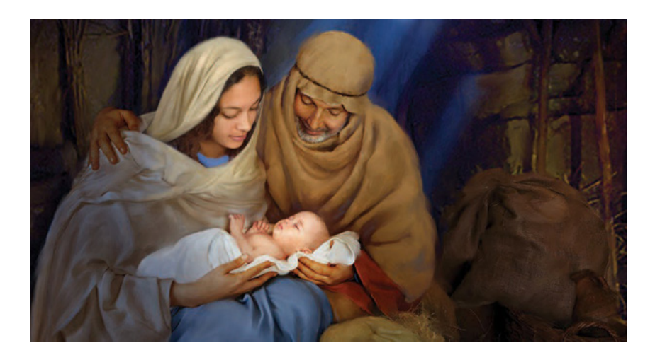
Wishing you a Blessed Christmas and a New Year filled with good health, happiness and peace.