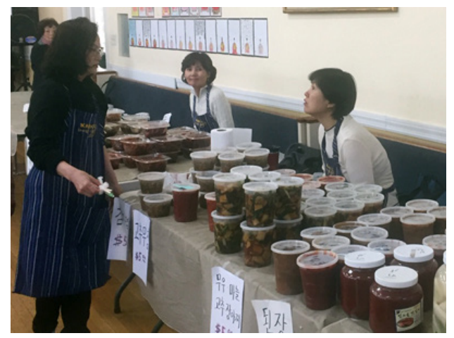
Packaged goods like Kimchi and other Korean foods were also available.