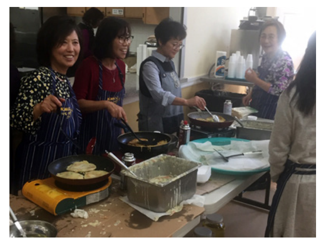
Cooked-to-order specialties were made on-site.

In November, parishioners at Korean Martyrs Church in Chicago held their bazaar, selling homemade Korean food and other delicacies to raise funds for the missions. The day was a great success!