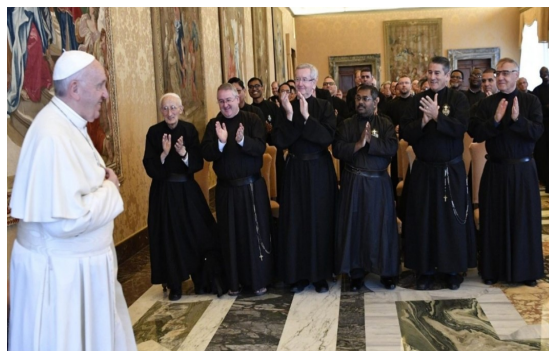
Private Audience with Pope Francis