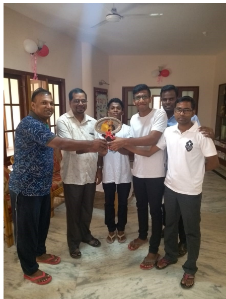
(Passionist Premier League) sports competitions as part of feast day celebrations in the community