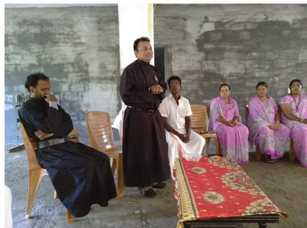
Feast day celebrations with the lay Passionist group at our parish, Palliport.