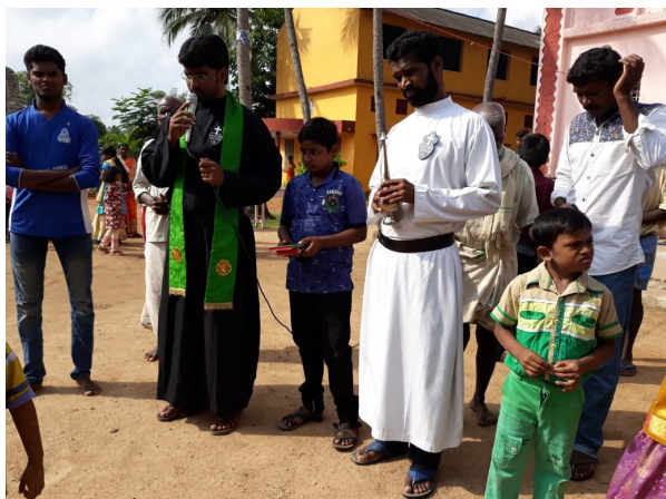
Randham Korattur, Tamil Nadu