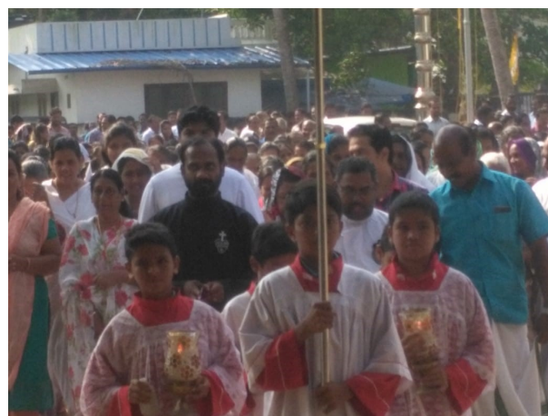
Memorial service for the dead observed as part of the Jubilee celebrations in Palliport Parish, Kerala.