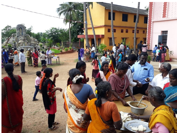
Randham Korattur, Tamil Nadu