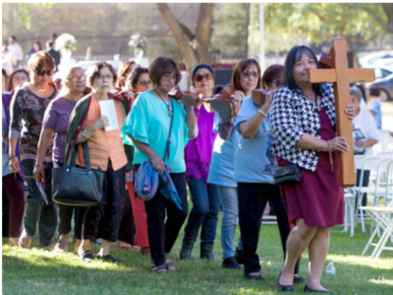
Leading the Marian Procession.