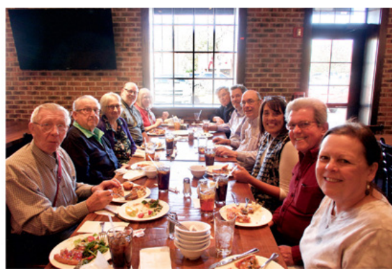
After Mass the group headed to Home Run Inn Pizza, a Chicago tradition, for a wonderful lunch.