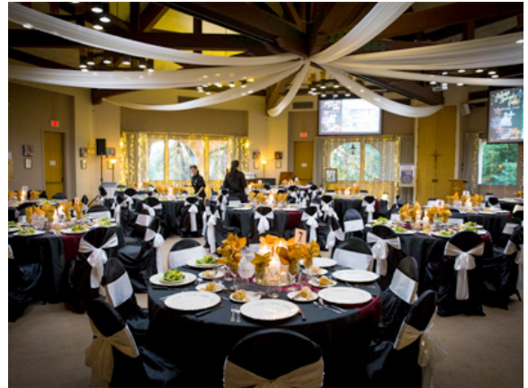
The Quinn Room was transformed into a beautiful and elegant space for dinner.