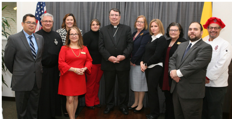
Holy Name staff with Archbishop Pierre.