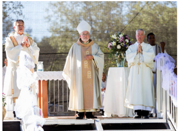
Bishop Jaime Soto at the procession.