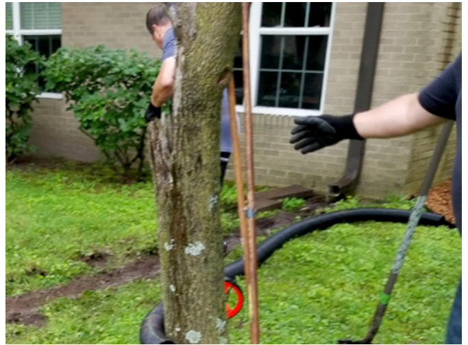
The trench was dug to lay the hose so that water can flow from the downspout to the garden.