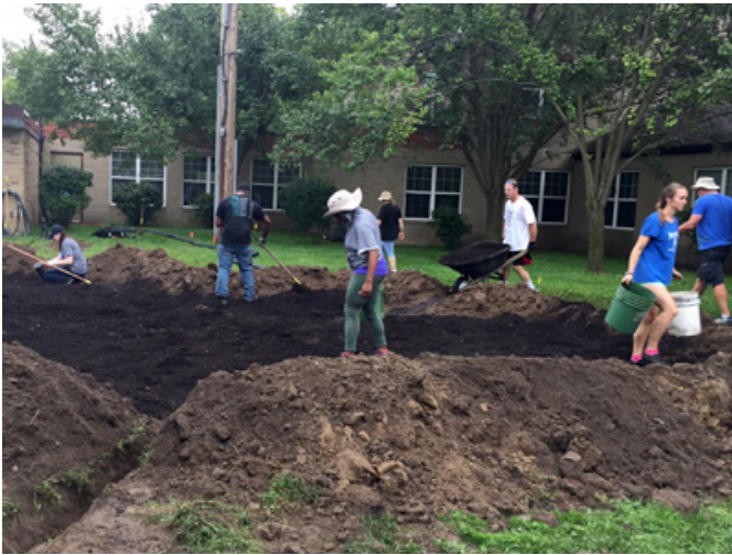
Volunteers work together to build the garden.