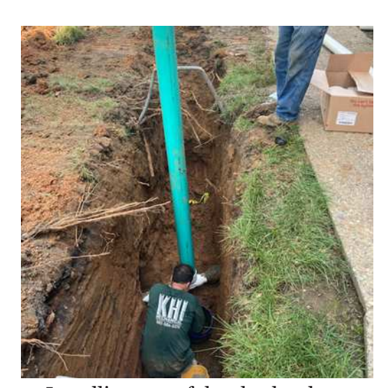
Installing one of the check valves.