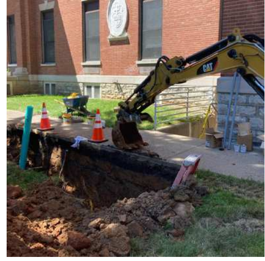
Plumbers dug the trench to access the underground pipes.

On June 11 and June 14, plumbers installed three check valves on the sewer line at Sacred Heart Monastery. The check valves will prevent a back-up and flooding in the monastery basement and protect the new exercise equipment obtained through a grant from Support Our Aging Religious (SOAR).