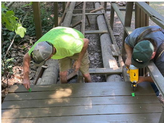
Volunteers work on replacing the boards of the bridge.