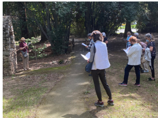
A group prays the Stations of the Cross on Good Friday.