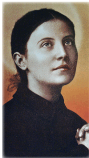
St. Gemma Galgani