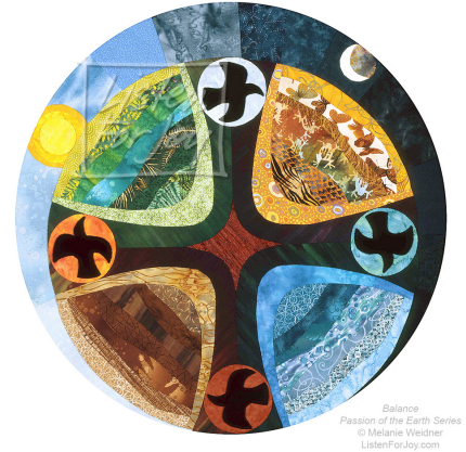
Balance Passion of the Earth Series