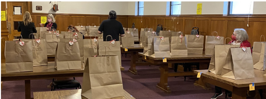
Meals are packed and ready for pick up.