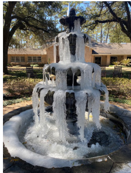
The fountain in the middle of the retreat center's courtyard was frozen over.