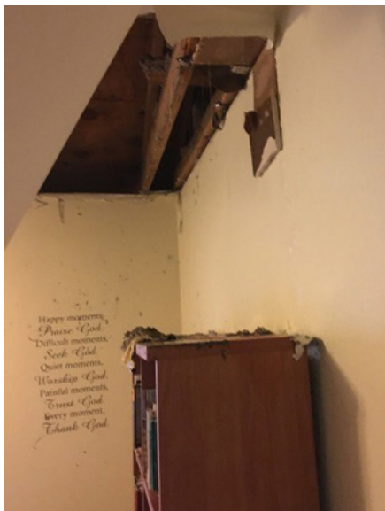
Water damage in one of the rooms of the retreat center.

Happy moments Praise God Difficult moments Seek God Quiet moments Worship God Painful moments Trust God Every Moment Thank God