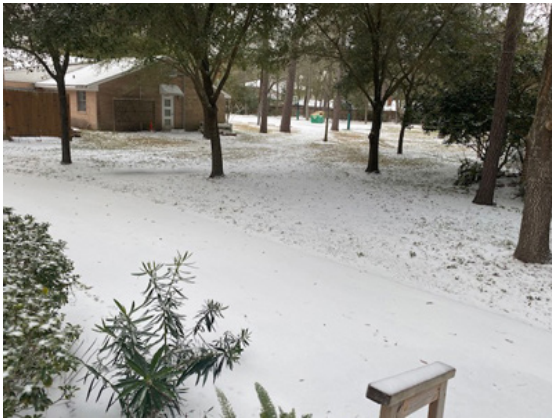
The retreat center grounds remained snow-covered for several days.

As everyone at Holy Name looks forward to the spring and Deacon Nicholas's ordination, it is a good reminder to look to God in all moments of our lives!