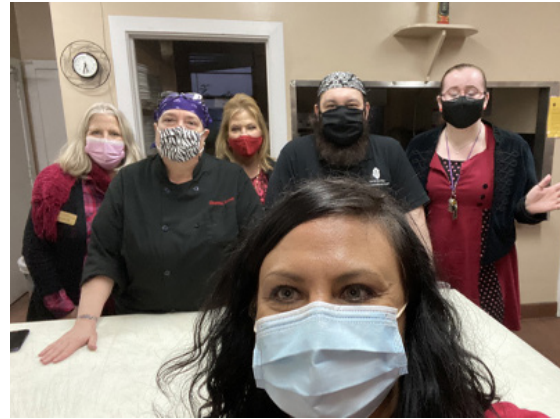
Christ the King staff were happy to be working together during the Valentine's Day event.