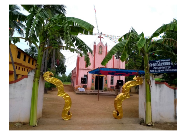
The feast was sponsored by St. Gabriel's Youth of Randham