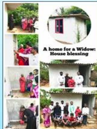
A home for a Widow: House blessing