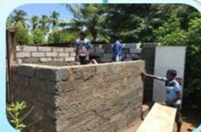
One brick at a time...