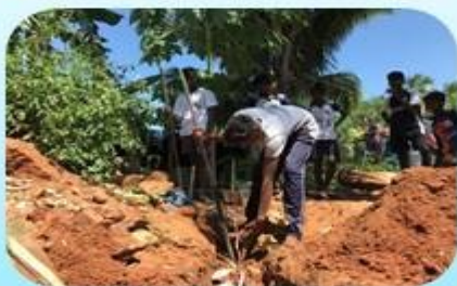
The Seed of Hope....