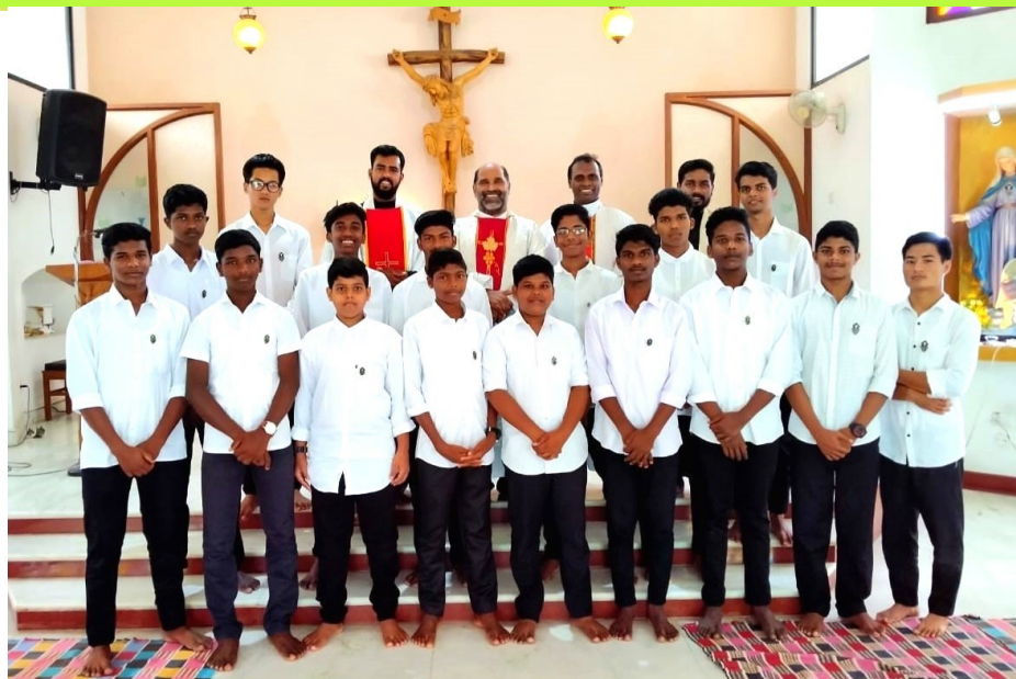
Inauguration of the New Academic year, 11 New Aspirants joined St. Gabriel's Minor Seminary at Kochi. (Above)