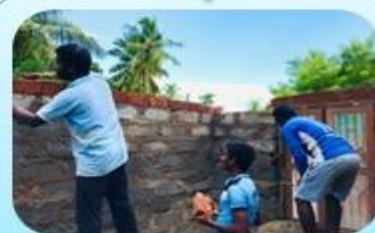
Lending our labour..