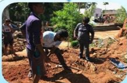
Together we started....