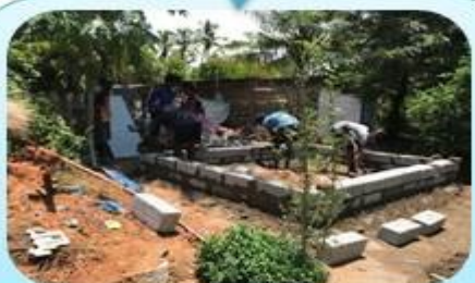
Putting our hands and minds together...