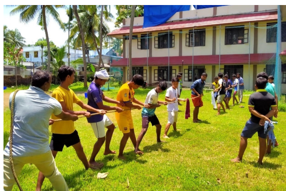
Onam Festival is celebrated at Kochi with the traditional Competitions. (Above)