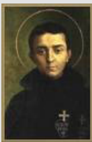
St. Gabriel Possenti

February 27 Feast of St. Gabriel Possenti