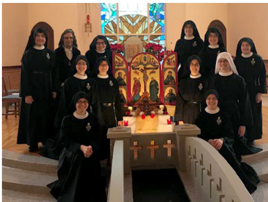
A stop on the journey included St. Joseph Monastery in Whitesville, Kentucky, with the Passionist Nuns.