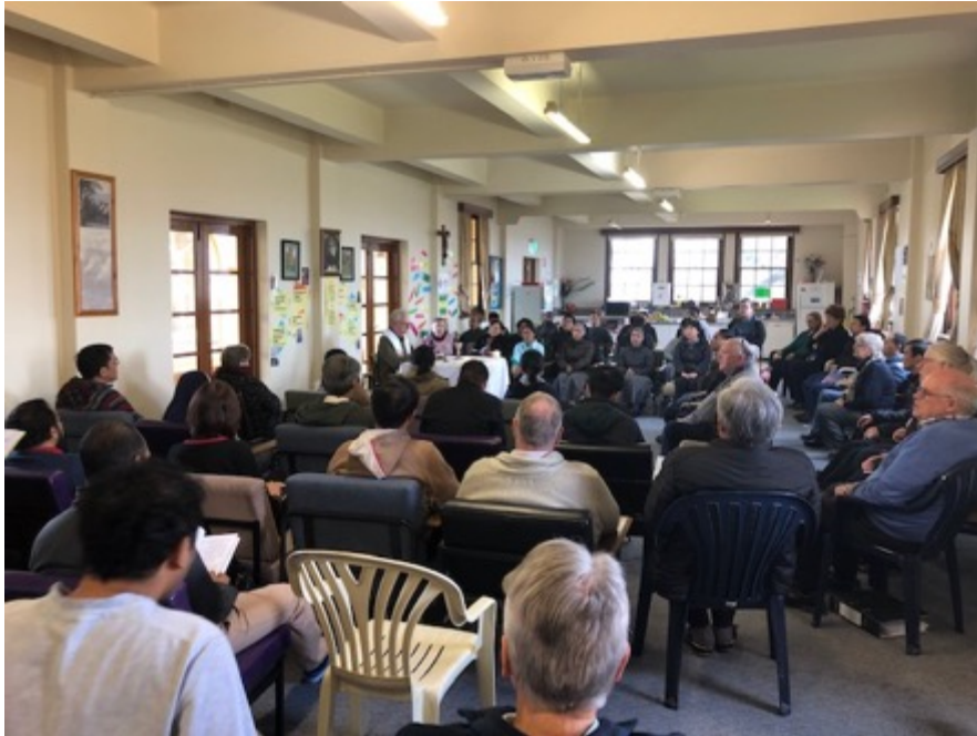
SHAPE \* MERGEFORMAT

Our ELSPM English language students are doing incredibly well. Once a week, with the theological students at Yarra Theological Union they share a mass in the Common Room. It is a regular highlight of the week