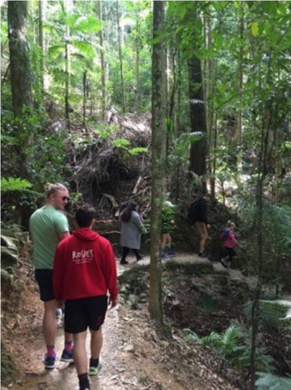
Bush walk Mid-Year