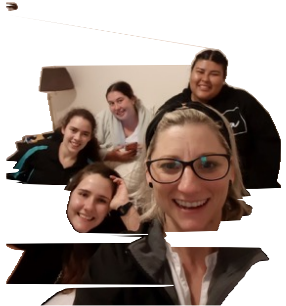
Girl time on Mid-Year