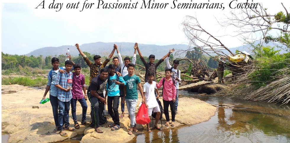
A day out for Passionist Minor Seminarians, Cochin