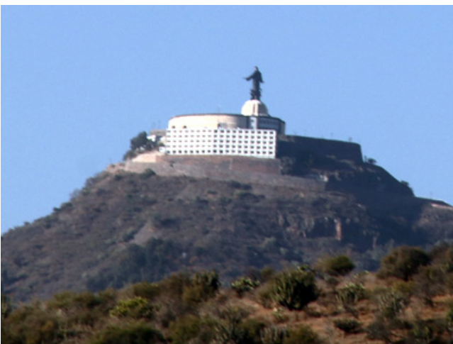
The Shrine of Cristo Rey, dedicated to the memory of the Mexicans martyred during the religious persecution in Mexico, 1910-1920.