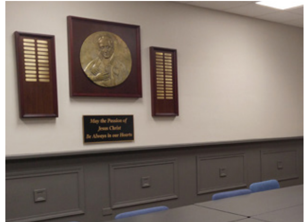
St. Paul of the Cross watches over the meetings and gatherings in the conference room.