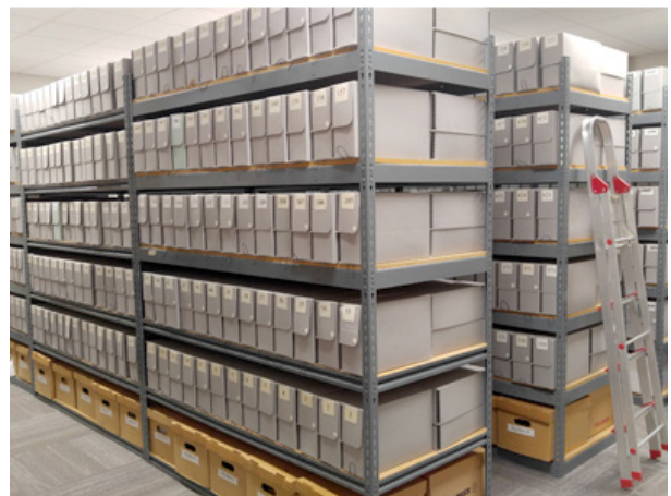
The archives are nestled into their space.