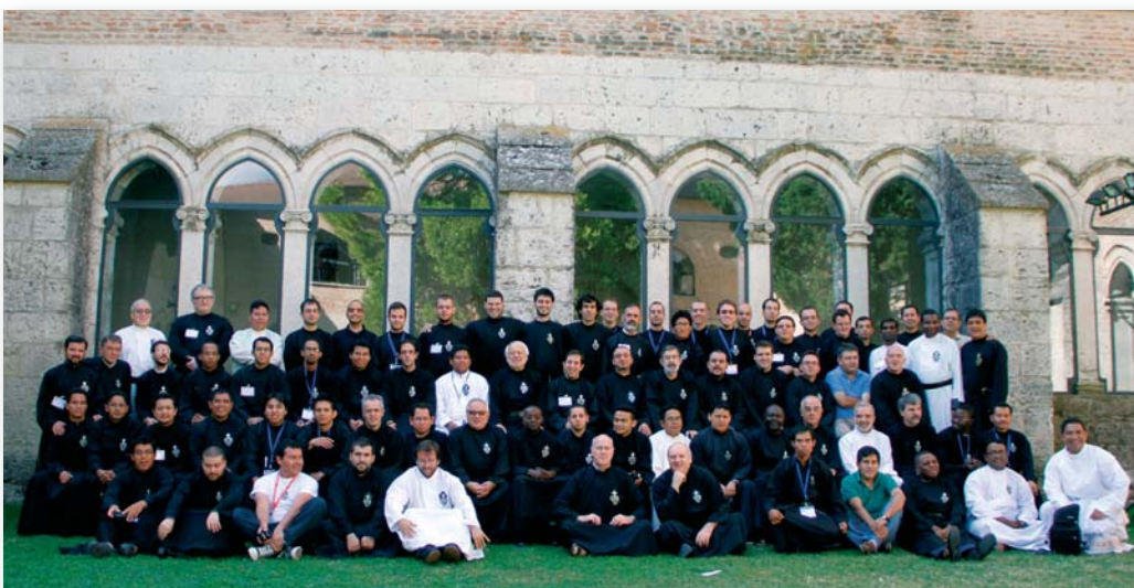
The Monastery of Peñafiel and the participants at the Young Passionists Meeting of World Youth Day.

Everything was prepared. It was good to sow the seed. Now may “the one who gives the growth” (1Cor.3:5-9) be with us! ●