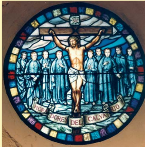
Stained glass window of Bl. Niceforo and companions in the Crypt of the Martyrs, Daimiel, Spain.

“This community of martyrs is a point of reference for the regeneration and the revitalization of our Passionist life. It was a large and very diverse community, but one that embraced the same charism, the same faith and the same fraternal life. Consequently, rather than be divided by individualistic options, they remained firm and united in drinking the same chalice of the Lord. Their common