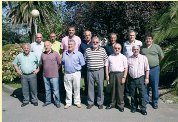
Members of the Sacred Heart Configuration.

They also made the following observations: (1) We need to strengthen the local community so that they maintains a high quality of life in the areas of prayer, fraternity and in the apostolate; (2) We are experiencing a paradoxical reality that where there are the most urgent and