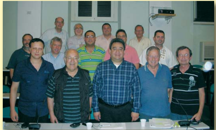
Members of the Jesus Crucified Configuration, Rome.

(1) the creation of channels of communication via internet in order to share information about the various initiatives of the various individual groups, as well information about formation in the areas of Restructuring as well as on-going formation. The same would also apply to the creation of a data base with information about individual religious and structures; (2) The creation of materials for spiritual development that could be used for communal celebrations in the various entities of each of the zones and within the entire Configuration. The principal target of this endeavor is not primarily individuals; rather individual communities that can participate using the