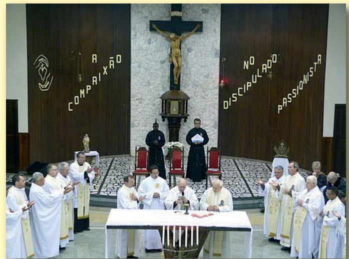
Concelebrated Mass marking 100 Years of Passionist presence in Brazil.