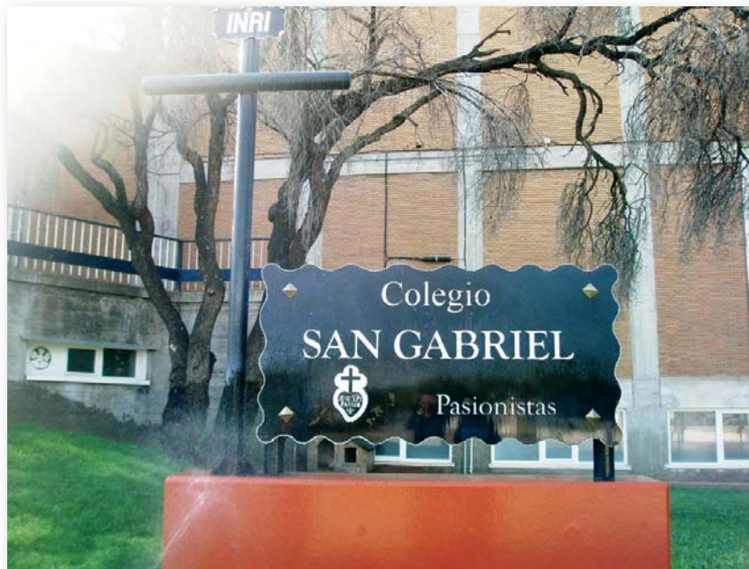
St. Gabriel School in Peñafiel.

Madrid for World Youth Day (where we were hosted at our own St Gabriel's College) were times for celebrating our identity and our solidarity and were an excellent opportunity to create new relationships and to know each other better.