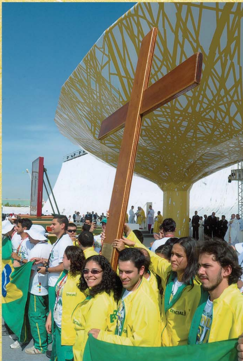
Young people from Brazil receive the Cross for the next WYD that will take place in Rio de Janeiro, Brazil, from 23 to 28 July 2013.

“Dear friends, the Cross often frightens us because it seems to be a denial of life. In fact, the opposite is true! It is God’s “yes” to mankind, the supreme expression of his love and the source from which eternal life flows. Indeed, it is from Jesus’ heart, pierced on the Cross, that this divine life streamed forth, ever accessible to those who raise their eyes towards the Crucified One. I can only urge you, then, to embrace the Cross of Jesus, the sign of God’s love, as the source of new life. Apart from Jesus Christ risen from the dead, there can be no salvation! He alone can free the world from evil and bring about the growth of the Kingdom of justice, peace and love to which we all aspire.”