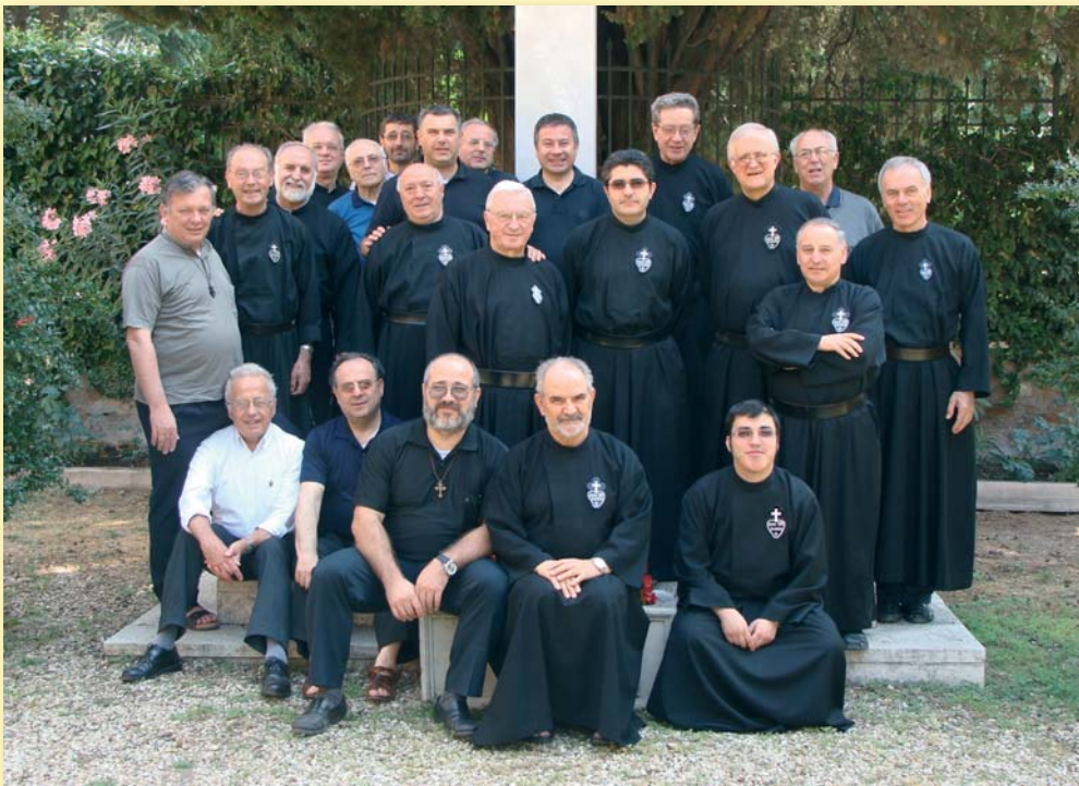
The Provincial Councils of the five Provinces that comprise the CEB Configuration: PIET, CORM, LAT, CFIXI and MICH.