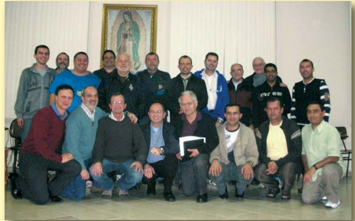
Zone B (Brazil) of the Configuration of Jesus Crucified.

The main purpose of the meeting was to prepare topics for the next assembly of the Configuration that will take place in Italy on 27-30 September. The principal topics were: 1) study juridical norms for Zone B of the Configuration that can be presented at the next General Chapter; 2) steps to be taken on common projects; 3)