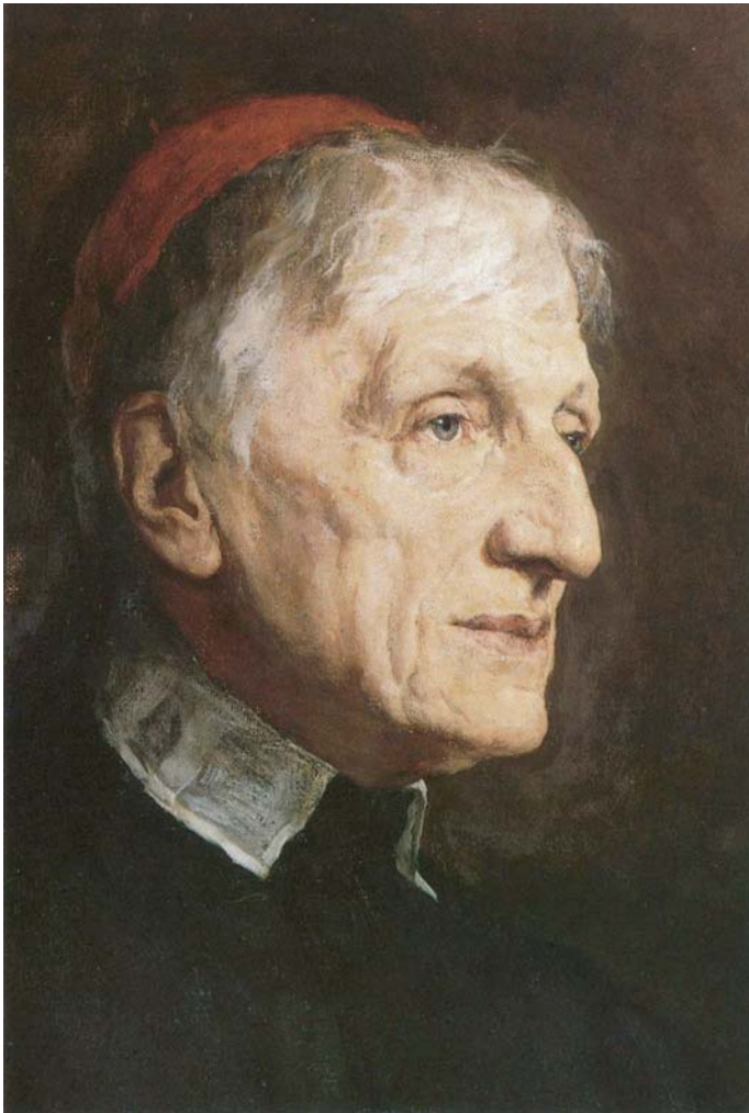
Cardinal John Henry Newman, Oratorian

certain about his faithfulness and conscious of the veracity of what he taught. He himself predicted that he would be appreciated only after his death. In fact, his fame has continued to increase and many find him a source of inspiration.