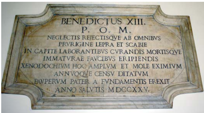
Dedication Plaque in the Hospital of San Gallicano

Our General Constitutions , at No. 3, state that: “We wish to share in the distress of all, especially those who are poor and neglected; we seek to offer them comfort and to relieve the burden of their sorrow”. Long before this version of the Rule and Constitutions was written, Paul of the Cross and his brother, John Baptist, found themselves in an environment which was to offer them a hands-on opportunity to minister to the poor and abandoned who were physically and spiritually distressed. The year was 1725, the Holy Year, and the opportunity was a new venture of Pope Benedict XIII: a hospital for those afflicted with diseases of the skin – the Institute of San Gallicano in the Trastevere section of Rome. Although there were various hospitals in Rome in the eighteenth century, there were none that cared for these people who were considered to be highly contagious and therefore, a high risk. Often they were abandoned or shunned, left to fend for themselves. As Rome prepared to receive pilgrims for the Holy Year, the Pope sought to provide a sanitary structure where these sick. The dedicatory plaque in the hospital summarizes the sentiments of the Holy Father: “ The father of the poor constructed from the foundations this hospice of large and