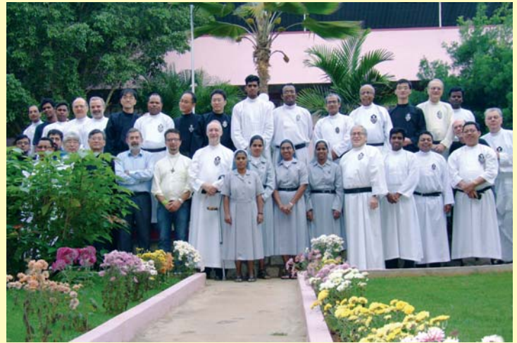
Participants in the Meeting of the PASPAC Configuration

This meeting addressed ways of developing models for structures of Solidarity in Personnel, Formation and Finance for the PASPAC Configuration, which is the ongoing work of the Congregational Restructuring process. The assembly continued the discussion of Solidarity structures and also issues and projects in which the Configuration is currently engaged. The most important project of the Configuration at this time is the International House of Formation in Manila where three Vietnamese, three Chinese and one Burmese student are engaged in an intensive six-month English language program.