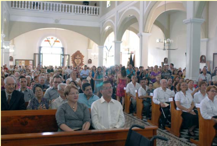
The Anniversary Mass in Lares, Puerto Rico.