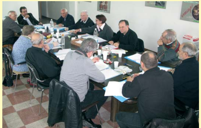
Coordinators of the Passionist National Lay Movement of Italy.

The goal of the MLP (Lay Passionist Movement)