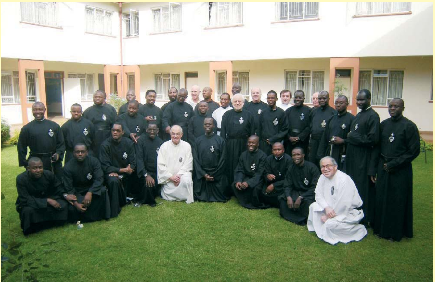
Meeting with students at the house of studies in Kisima, Kenya.

After the departure of the General and Council the CPA Leaders continued their own meeting to focus on the creation of two possible models for the future development of ‘institutional solidarity’ within the configuration (as mandated by last meeting of the General Council and the Coordinators for Restructuring). Our thanks go out to the members of the Vicariate of CARLW (Kenya) for hosting these two encounters. ●