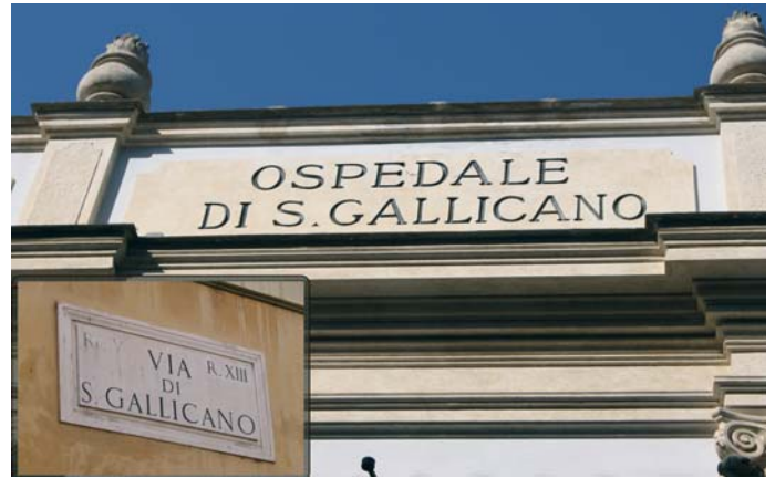
The Hospital of San Gallicano, Rome