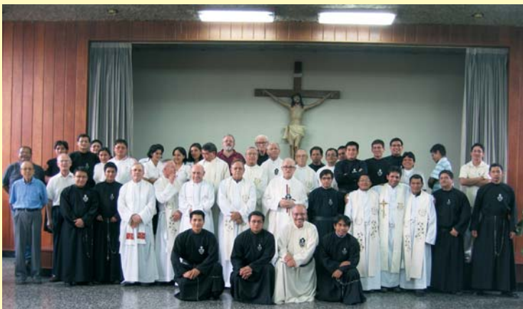
Participants in the CORI-RES Congress

The agenda for the meeting listed the following points: 1) reports on the various formation programs in the different areas of the Configuration, including the number of religious in formation in each of the phases of formation; 2) reports on the houses that are presently designated for formation and possibilities of additional centers; 3) information about the various institutions that our religious frequent for studies; 4) the experience of the inter-cultural student center of the Claretian missionaries in Bogotá, Colombia; 5) information about possible additional formation personnel in the Configuration, including their preparation and studies; 6) a report on FORPAL (Formation Programs for Latin America); 7) criteria, proposals and additional decisions concerning formation; and 8) the preparation of a WEB page for the Configuration. ●