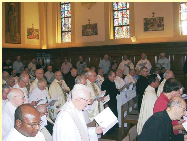
Members of the PAUL Provincial Assembly.

The Provincial concluded his address by reiterating that “our goal is to reposition our future in the light of the Reconfiguration of the entire Congregation. The healthier we are in our Province, the better we can contribute to the health and well-being of Passionist presence, Charism and mission throughout the world”. ●