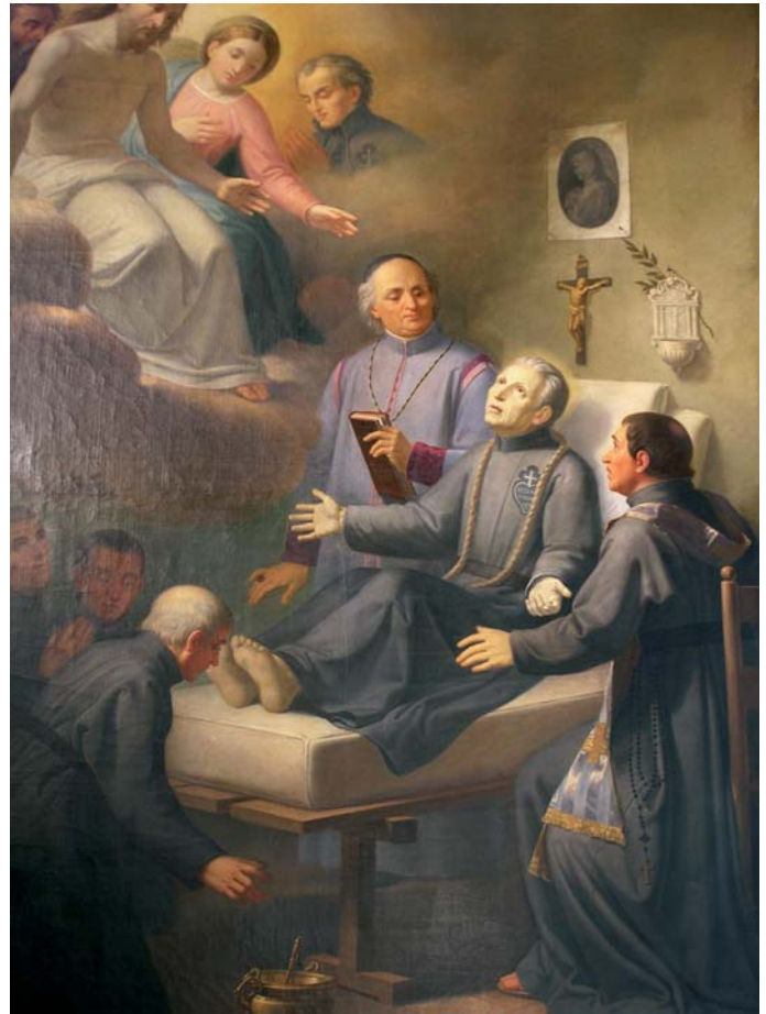
The death scene of St. Paul of the Cross, Room of the Founder, Rome

One of my favorite paintings is that of “Estasi di S. Paolo Croce” in SS. John and Paul, Rome. Paul embraces Jesus Crucified; Jesus reaches down