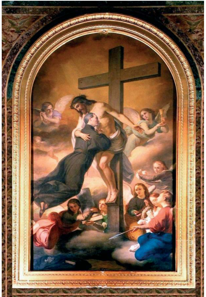
St. Paul of the Cross in Ecstasy, Basilica of Sts. John and Paul, Rome

This is our story. If we die with the Lord, we will rise with the Lord. Ministry to the bereaved consists in being a companion to those who experience multiple losses, helping them walk their journey of Gethsemane, Calvary, Golgotha. I believe that I cannot be a worthy companion to those bereaved unless I am immersed in my own passion experience united to that of Jesus Crucified. Jesus dies on the cross but the story did not end there. On the third day, in and through the power of God, His Father, Jesus rose from the dead. This, too, is our faith. In healthy grieving, we gradually die, letting go of all in the hope that with Jesus, we will have a new experience of life. Our goal is not the tomb but the fullness of life: “I have come that they may have life and have it to the full” (John 10:10).