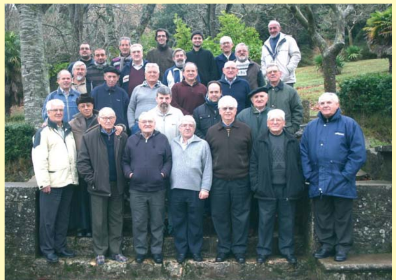
Members of the CORI Province Assembly

Twenty nine Passionists from the central zone of Spain attended. The theme for the meeting was: "Looking at the quality of our life and mission". It was studied in light of Solidarity in its three dimensions: formation, personnel and finances. The agenda listed the following topics for discussion: the projects of the individual communities; discernment of present forms of our presence in various regions based on previous reflection, the current reality, and the criteria presented at the last Provincial Chapter; presentation of reports and decisions that were made concerning the Configuration of the Sacred Heart (a Vocation team approach for Spain; the meeting of