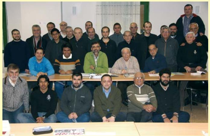
Religious who attended the FAM Province Assembly

In the area of "Passion for Youth and Vocations" these areas were studied: 1) Making a religious available and, if possible create a pastoral youth vocation team in each zone composed of religious and laity in coordination with the Configuration; 2) In each zone designate a community as a reference point for promoting activities and projects for youth; 3) Promote Passionist vocations through mass media and new technologies.