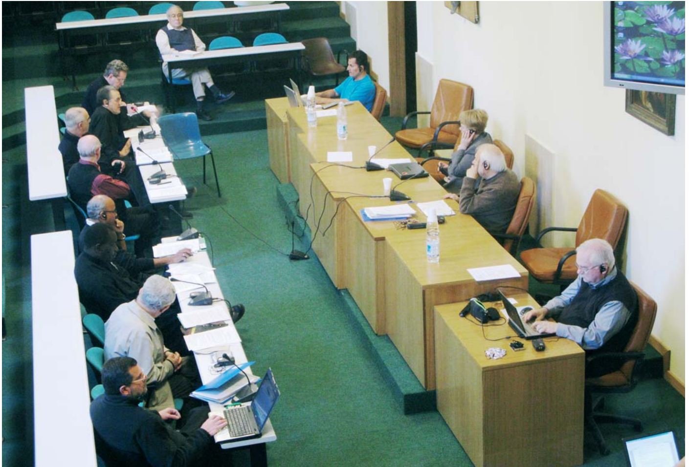
Coordinators meeting in the Aula of the Generalate