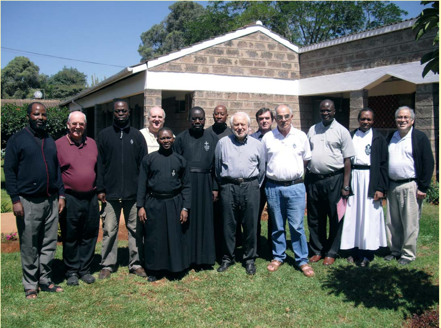
Meeting of the Superior General and Council with the CPA Configuration.