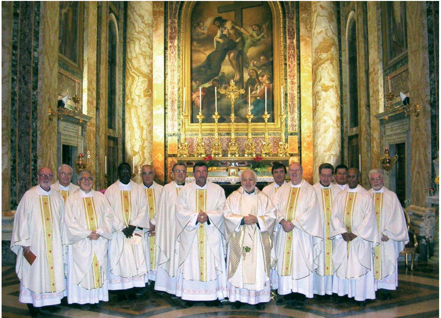
Coordinators of the Configurations with Fr. General and Council

Configuration. Finally, what might be possible models for future juridical entities and their forms of government? Concerning this final point, the six coordinators were in agreement concerning the model of the Congregation with six juridical entities, each with a leader and a council of four consultors that would represent each of the zones of the Configuration. They acknowledged that there were differences in the process that need to be addressed and that there are difficulties in each Configuration that need to be overcome; however it was possible to discern a common goal at the end of the process.