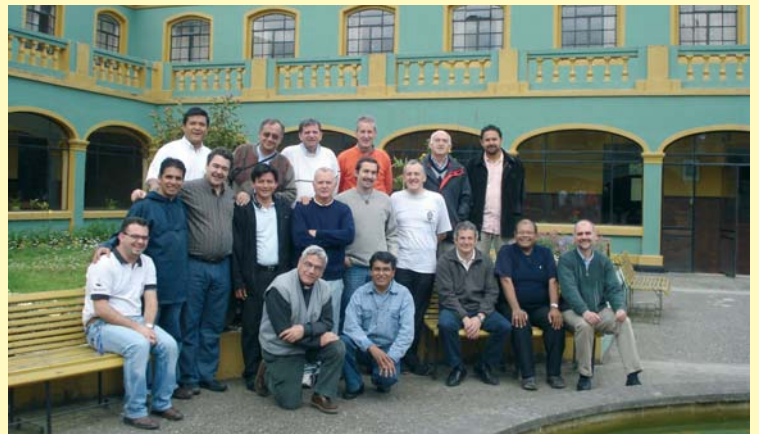
The Superiors and Formation Personnel of the Sacred Heart Configuration.