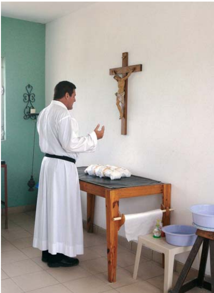
"Passionists in the spirit of St. Paul of the Cross are called in a special way to understand death and dying".