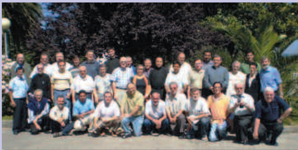
Passionist Religious and Laity of the CII Conference.

“Jesus the Prophet of the Passion of God” was directed by Fr. Angel Aparicio, CMF. The presentations followed these seven topics: (1) the identity of the prophet; (2) Who do you say that I am?; (3) the prophetic awareness; (4) the prophetic announcement; (5) the temptations of the prophet; (6) the witness of the prophet and (7) in the footsteps of the prophet.