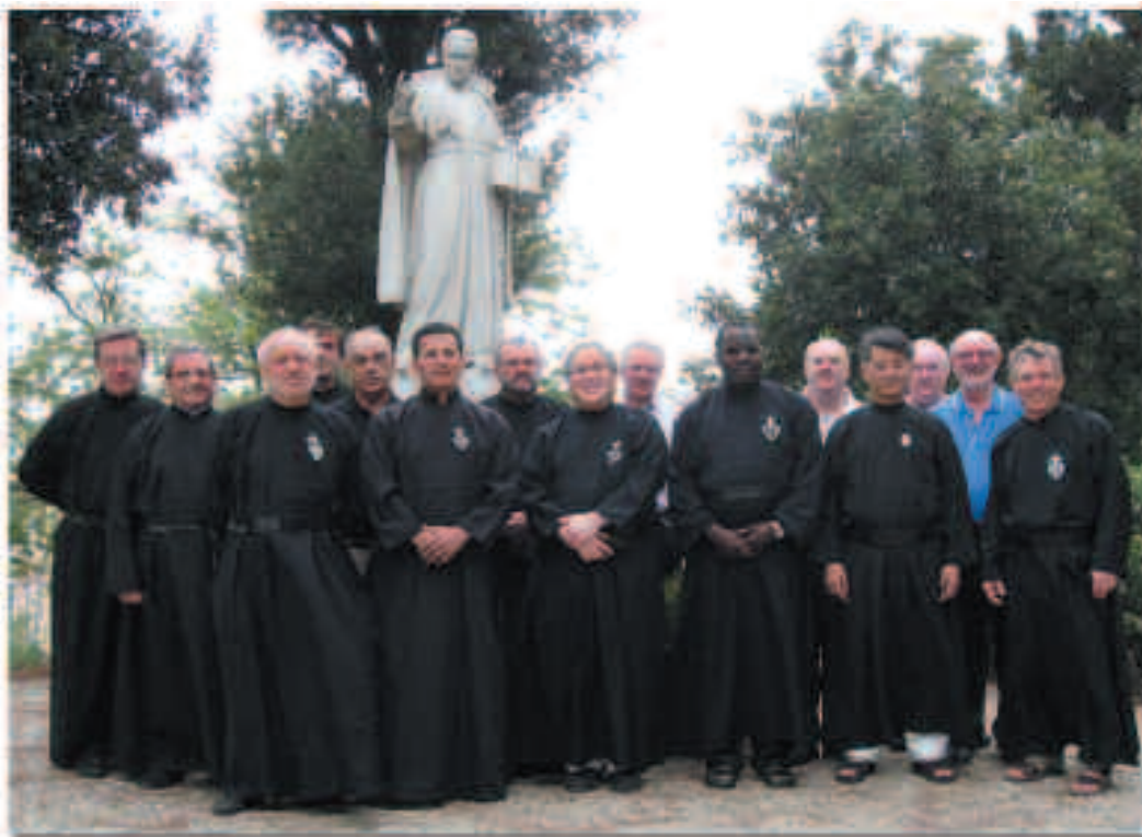
Fr. General, the General Curia and the Regional Coordinators.

The Coordinators were reminded that their next meeting will take place in Spain, May 2-8, 2008.