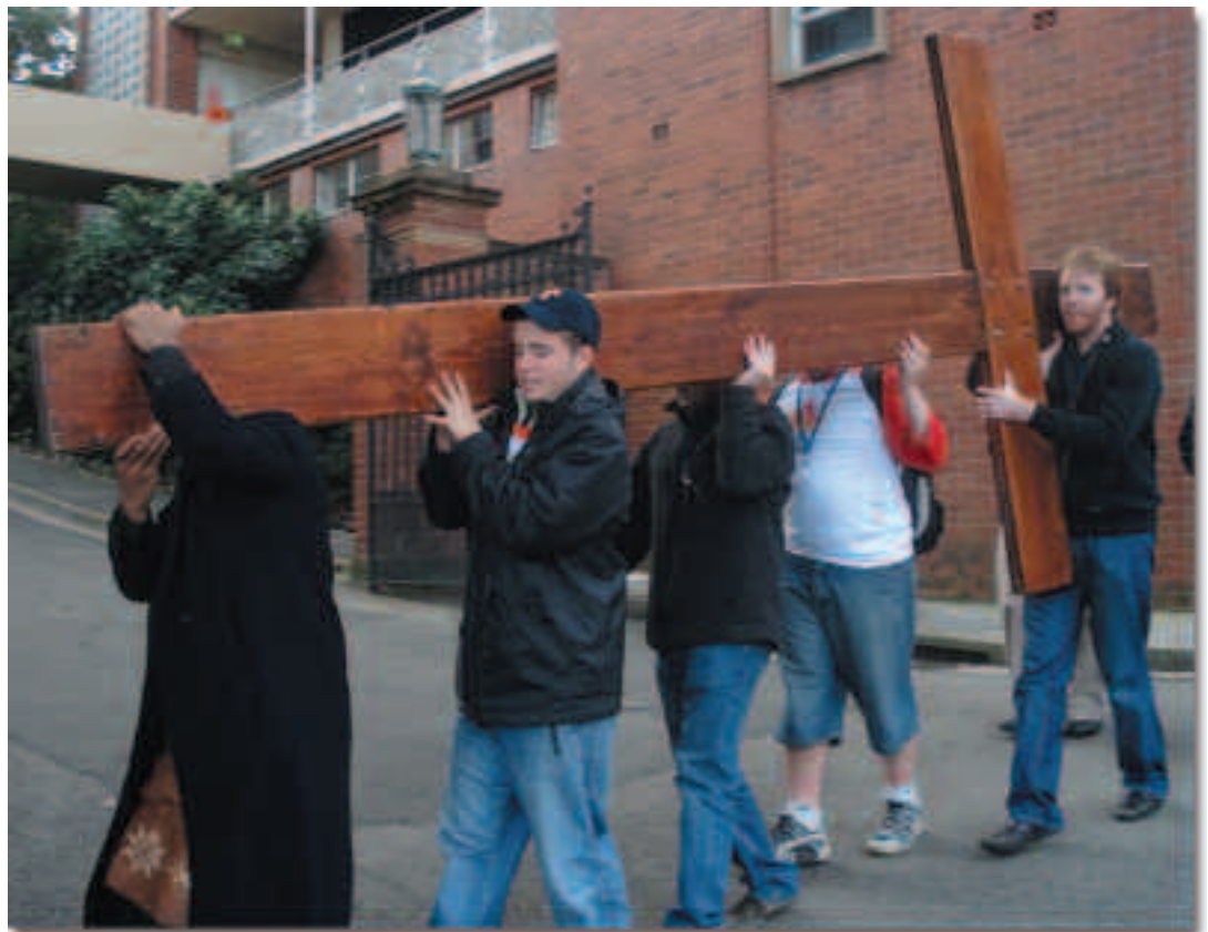
The World Youth Day Cross in pilgrimage in Australia.