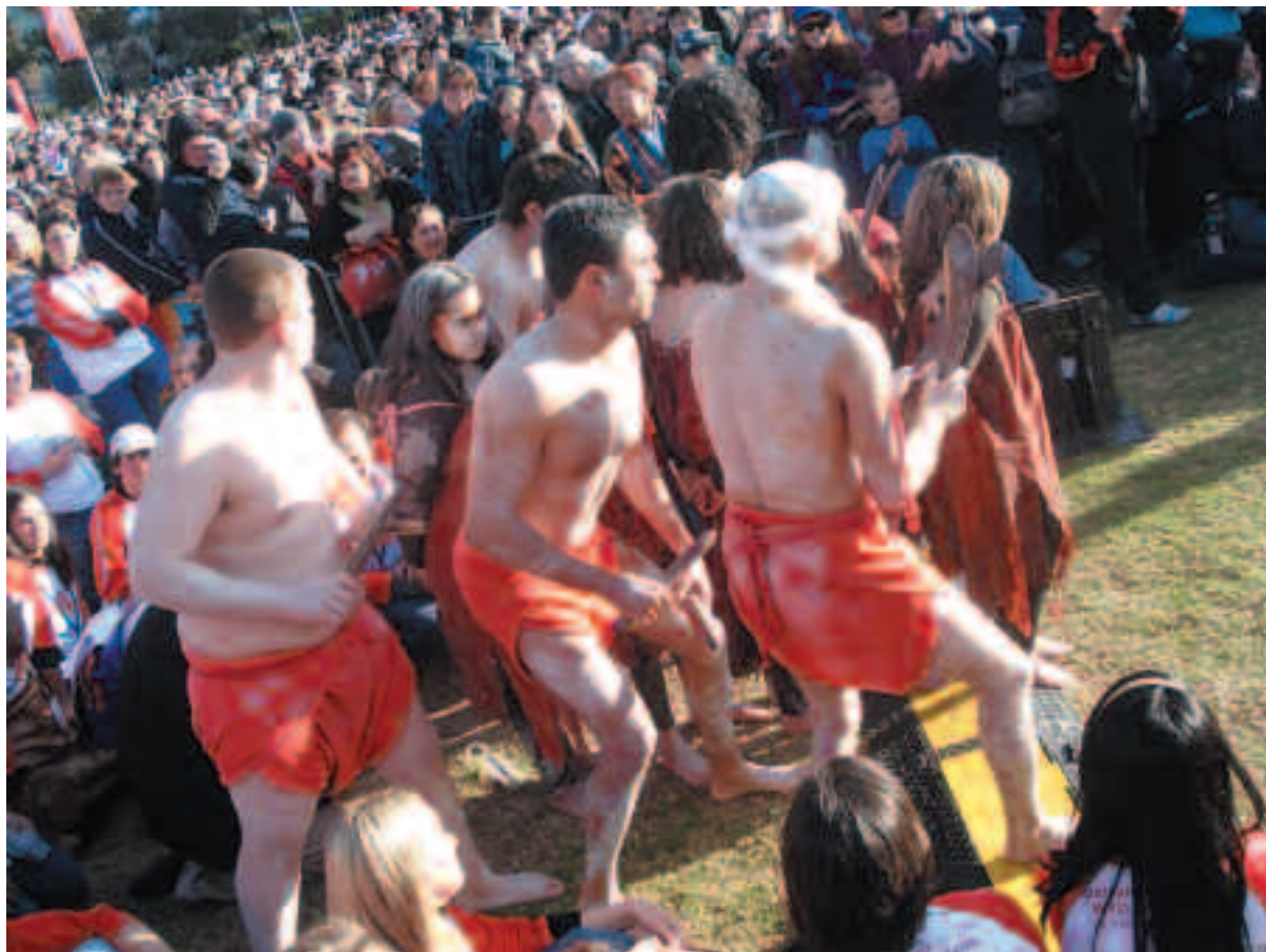
Australian Aborigines welcome the WYD Cross.