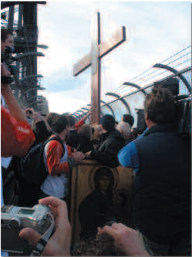
The World Youth Day Cross and Icon travel throughout Australia.

The following are the reflections of our young people. As we continue to invite more and more young adults to share this time of Pilgrimage that leads us to Melbourne for the Passionist Youth Encounter and then to Sydney for World Youth Day, we open ourselves up to new levels of encounter with them. Perhaps in this way we will fulfill our dreams of a new mission with young people from both the General and Provincial Chapters.