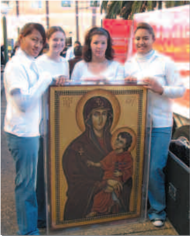
The Icon is a representation of the Icon: "Salus Populi Romani" (Protectress of the Roman People) from the Basilica of St. Mary Major in Rome. Before this Icon of Mary in September, 1721 St. Paul of the Cross made the vow to promote the memory of the Passion of Jesus and to work to gather companions to do the same.