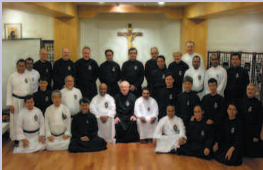
Fr. General, the General Curia and members of the PASPAC Conference.

“All which took place at the gate to the city of Naim that day, was so much like his sorrowful and dramatic finish would be. In a short while, the cortege would arrive at the sepulcher, maybe only a few hundred meters farther along the road, and the ground would have enveloped the dead young man. Everything seemed to be over, without hope or resolution. However, from the merciful intervention of Jesus is born a new life and joy: Then, he