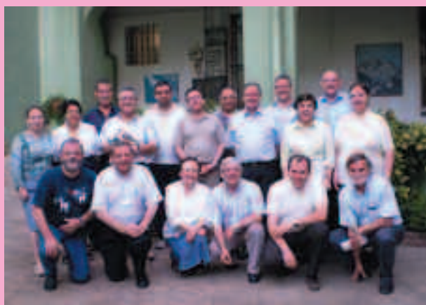
Passionists of the CII Conference and Passionist women religious.

During a meeting of the Interprovincial Iberian Conference (CII), 19- 20 June, together with the Passionist women religious there was a celebration of the first centenary of the birth of the Foundress of the Servants of the Passion (“Las Siervas de la Pasión”). The gathering took place in the community of the Servants of the Passion in Barcelona, Spain. Present were the Provincial Councils of the four Iberian Provinces, the Provincial of the Passionist Sisters of St. Paul of the Cross, the Daughters of the Passion (“Las Hijas de la Pasión”) and the Superior General of the Servants of the Passion.