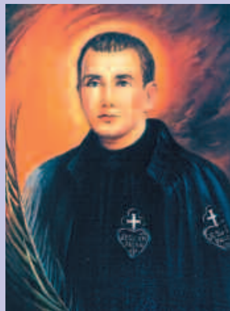
“On 9 October 1934, the Lord gave the community of Mieres the privilege of the martyrdom of one of its religious, St. Inocencio of Mary Immaculate.”

presence of the this saint and fellow religious be a sign of hope for the future of the community and the Province and an invitation to keep alive that religious testimony that inspired it to accept this monastery in the town of Mieres since 30 January 1907 and that offered it the possibility of surviving tragic events such as these.”