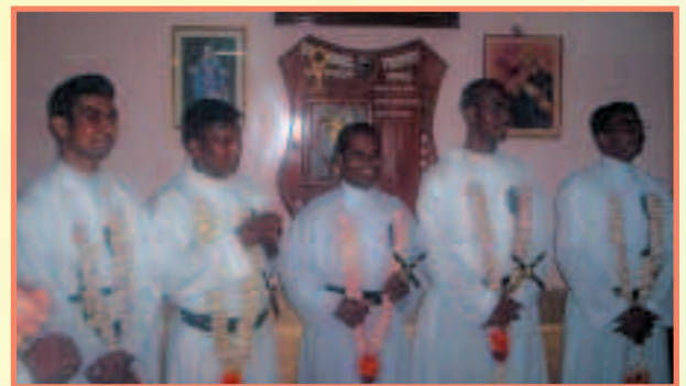
Celebration of First Vows in the CRUC-THOM Vicariate of India