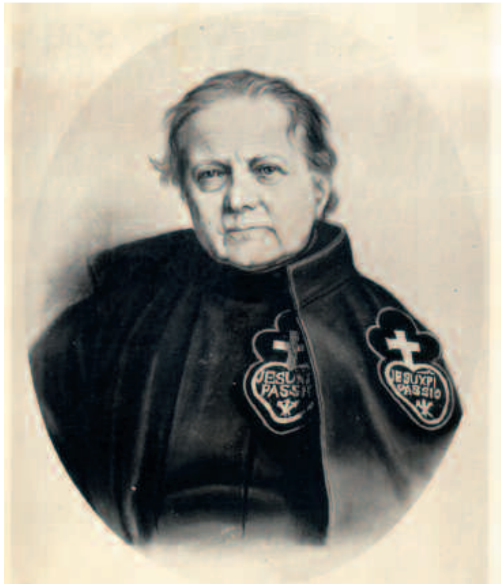
The Servant of God, Fr. Ignatius Spencer (1799-1864)

During the years that he spent in England and in Ireland, Fr. Charles was an authentic witness to Christ and a fervent apostle of the message of salvation in his spirit of dedication and charity which in turn made him appreciated and loved by all who came in contact with him. The seed that he sowed ushered in a new season of Christian unity and the entire ecumenical movement.