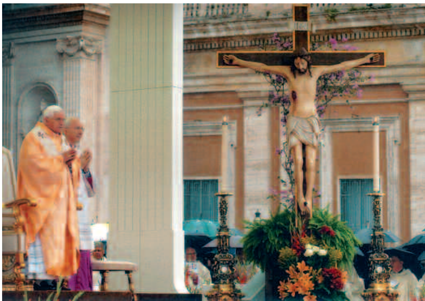
“Crucifix at the Papal Altar during the Canonization.”

For those who knew him the most outstanding