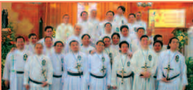
Celebration of First Vows in the PASS Province of the Philippines