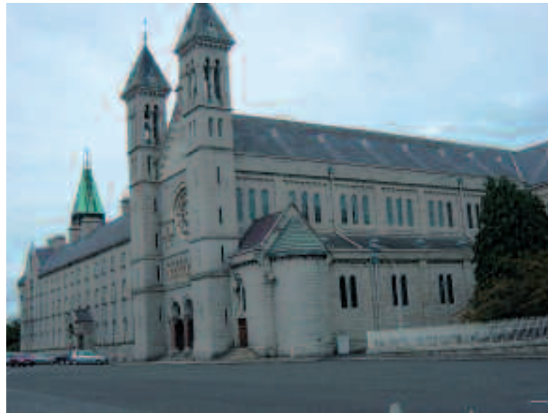
Monastery of Mt. Argus, Dublin, Ireland

During the final years of his life, following an accident during one of his travels, he was in constant pain. This situation was an opportunity for him to draw even closer to Christ. In one of his letters we read: “The Cross that is borne patiently is a great help for eternal salvation.” His “sickly