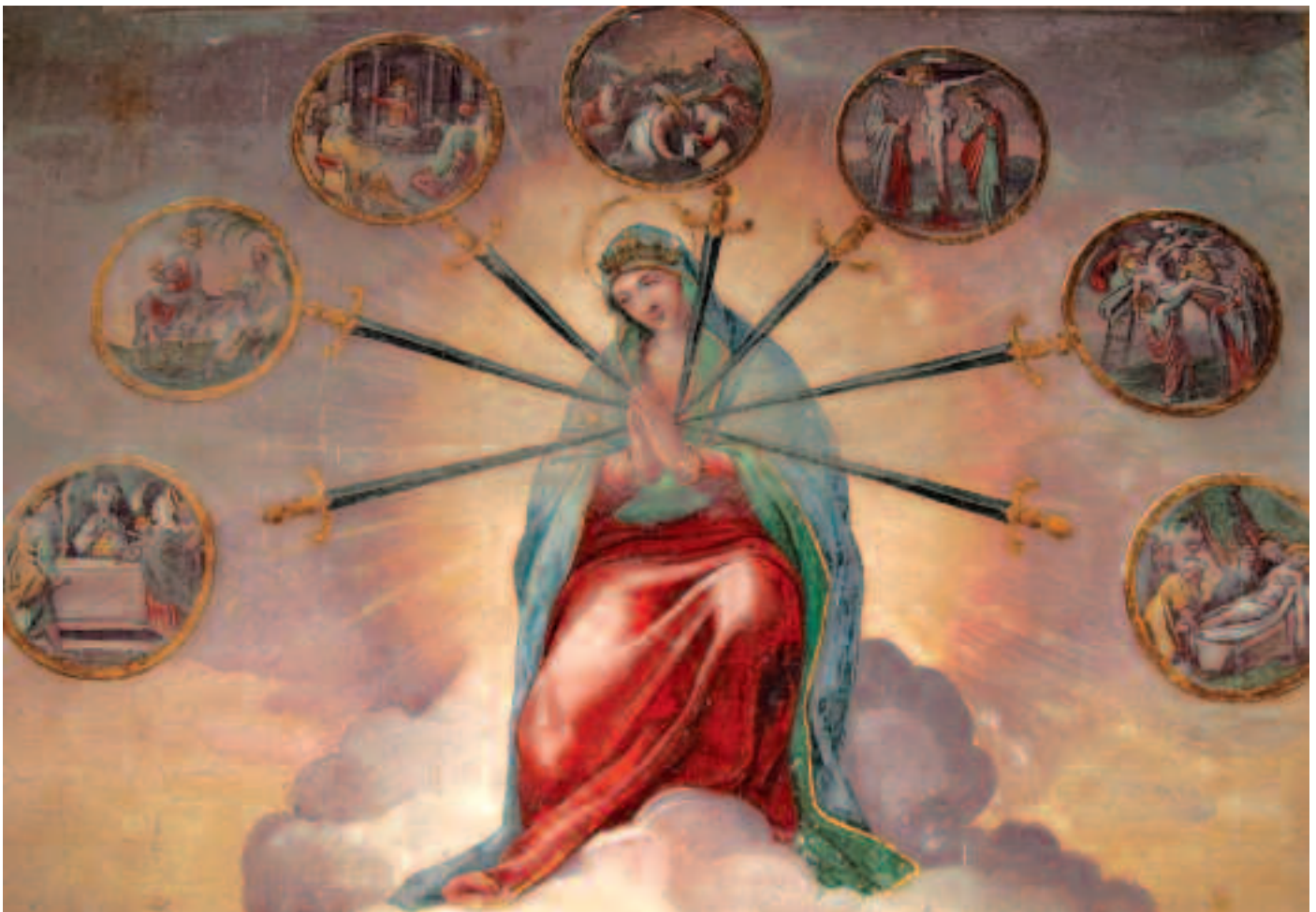
"The most remarkable aspect of his veneration of Mary was his devotion to her Sorrows". (The Seven Sorrows of Mary, Church of Santo Stefano Rotondo, Rome)

There was no greater joy for the heart of this dear old man than to assemble the young religious to sing together with him a hymn to Mary. And when the church bells sounded to praise Mary, he paused and listened with obvious delight. The sublime words of the Magnificat that were sung during solemn Vespers made his heart beat faster