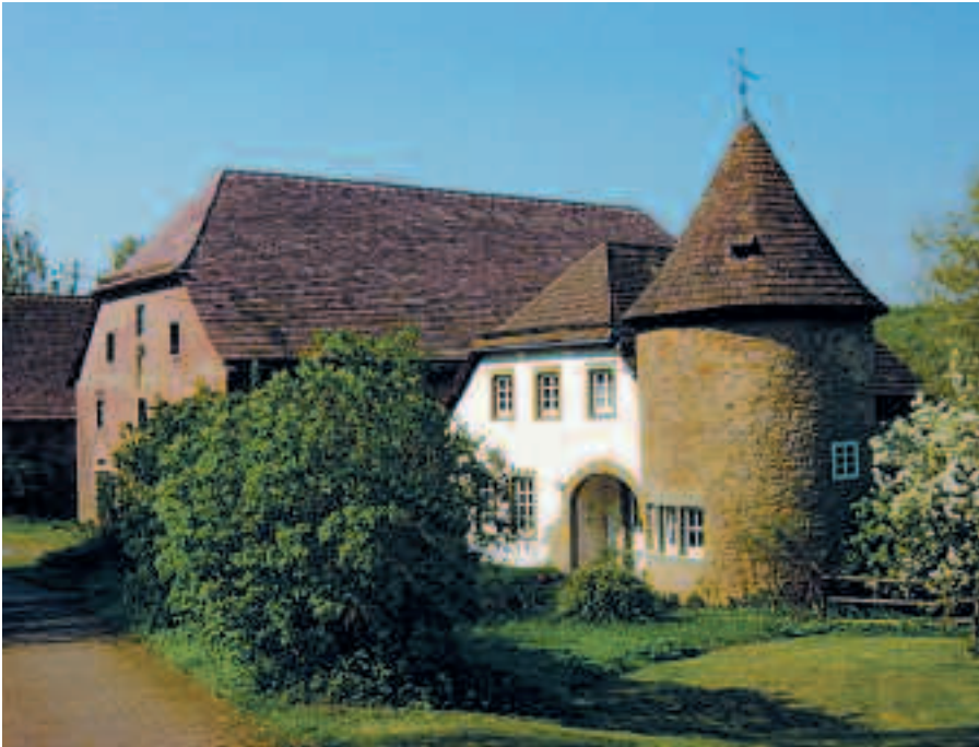
Birthplace of St. Charles, Munstergeleen, Holland

Fr. Charles of St. Andrew, known in secular life as John Andrew Houben, was born on 11 December 1821 in Munstergeleen, in the diocese of Ruremond (Holland), the fourth of eleven children. He was baptized the same day with the name John Andrew.