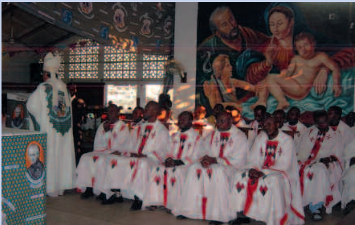
"Mass celebrating the 75th Anniversary of the Passionist foundation in Congo."

The Congregation began to expand beyond the initial missionary zone and in 1964 it entered Kinshasha and then in 1983, Lumbi. In 1980 the first candidates for Passionist life were accepted and in 1982 the Regional Vicariate of Christ the Savior was erected. In 1986 the Provincial Chapter established a fund for formation in the Vicariate and in 1989 the Province and the Vicariate began