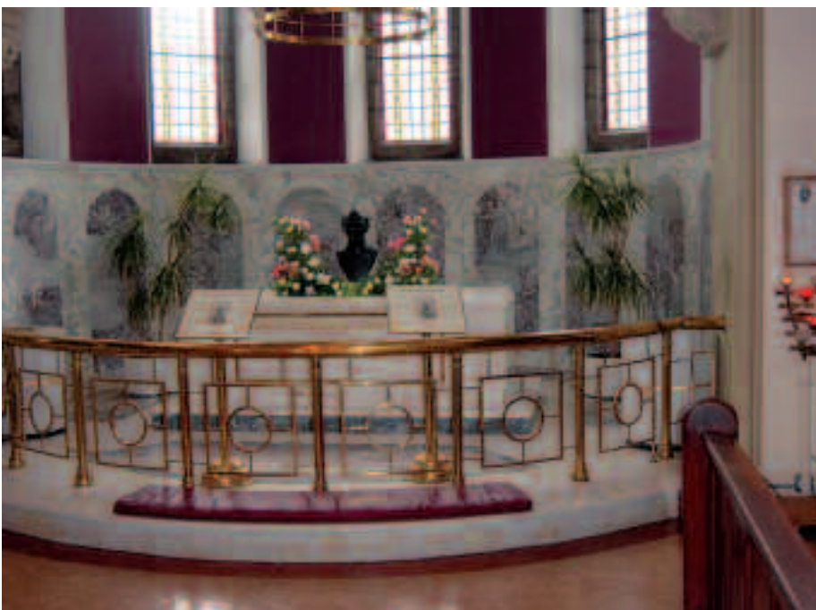
Tomb of St. Charles in the Monastery Church of Mt. Argus, Dublin

He also frequently recommended to others that they use the Crucifix. In one of his letters to a man who was in danger of death and was who was alienated from the Church, among other things he advised that an image of Christ in Agony be