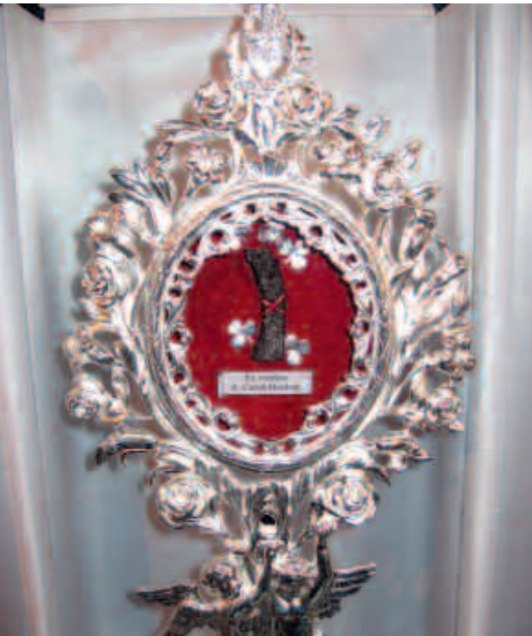
Relic of St. Charles of Mt. Argus presented during the Canonization ceremony

shown to the man, who by his indifference was deprived of the light of Faith.