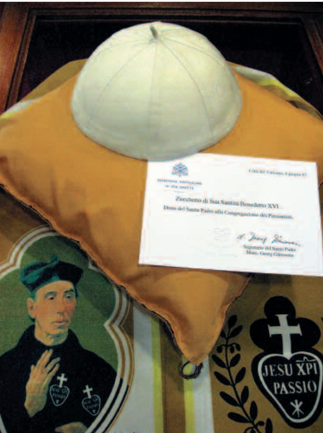
Zucchetto worn by Pope Benedict XVI during the canonization and presented to the Passionists

At 10:00 AM, on the Solemnity of the Most Holy Trinity, the Holy Father Benedict XVI celebrated the Eucharist in the piazza of the Vatican Basilica and canonized four Beati among them Charles of St. Andrew Houben (1821-1893).