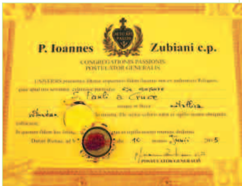
Authentics documentation and relic with wax seal

Therefore it is necessary to return to the application of that legislation that is recognized and used by the Congregation for the Causes of the Saints, the particular legislation that is not found in the present Code of Canon Law, and which, however, is already contained in the Code of 1917 and which is referred to in an article by Cardinal Palazzini, the Prefect of this Congregation, in which he states: (1), "Regarding the norms provided for the discipline of the cult of relics: Any unofficial (not-formally recognized) relic, old or recent, whether of canonized or beatified saints, or of those who died in odor of sanctity, even if the relic is not officially recognized and approved, may be venerated privately. (...) unofficial relics worthy of the same honor may be retained in private homes or carried by the faithful (can. 1282 § 1). This is not the case with legitimate relics of the saints and beati, except with the permission of the Ordinary of the locale (can. 1282 § 1). (2) In order for relics to be used in public worship prior ecclesiastical authorization is always required, by which a decision is made regarding the authenticity of the relic that is being displayed for public veneration.