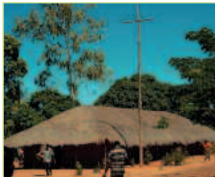
The Passionist church in Metoro, Mozambique