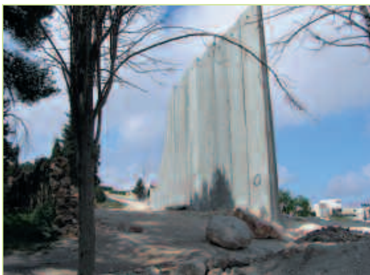
Israeli wall dividing our monastery garden

We are seeking religious who are willing to make this dream a reality!