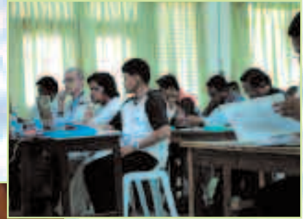
The delegates deliberate at the PASS Chapter