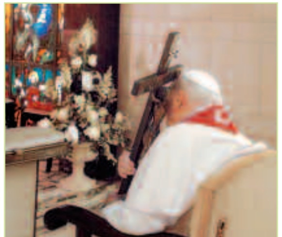
John Paul II - Good Friday 2005

5. However unity doesn't presuppose compromising gospel truths. He was fully aware that what he said or did would not please everyone. On one of his visits to the US he quoted the apostle St. Paul regarding preaching in season and out of season. The important thing for him was to preach the gospel message of