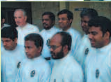
Religious of the CRUC-THOM Vicariate