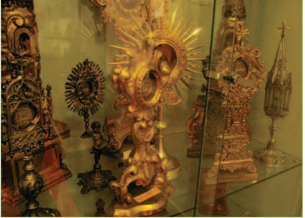
Various relics at Sts. John and Paul

served, permission must be sought from the Holy See prior to the nulla osta of the local Ordinaries.