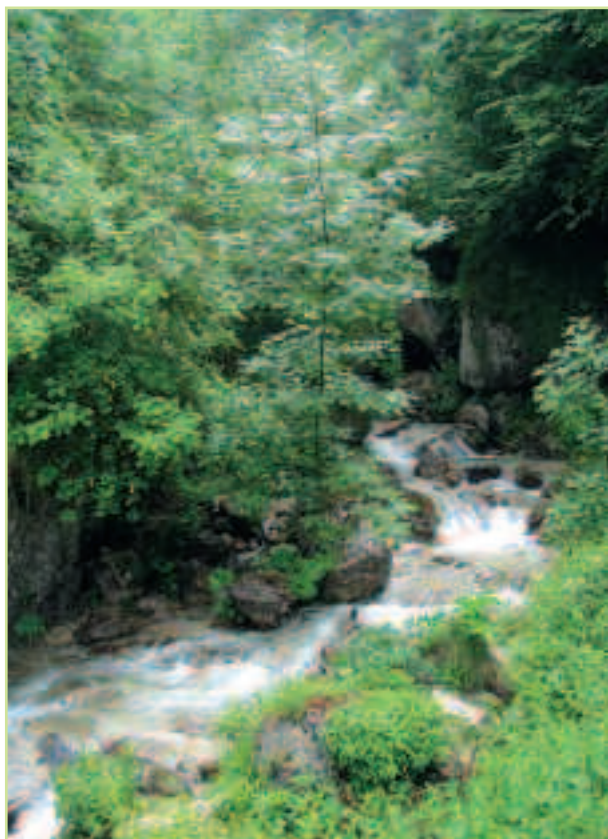
"The strength and the flexibility to adapt..."