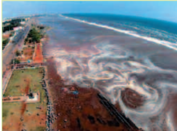
The effects of the Tsunami

Such a transformation is desperately needed in every corner of the globe. It is in Asia that the lines of it are already discernible. The human solidarity called forth by the Indian Ocean Tsunami, is but a shadow of the power of human solidarity wholeheartedly embraced in the spirit of Jesus by those who live by the power of the Cross. Passionists will always come to the aid of their Passionist brothers and sisters in need. But far more important is that all of us let go of what lifts us above our brothers and sisters in the flesh, the blessed poor of our own societies.