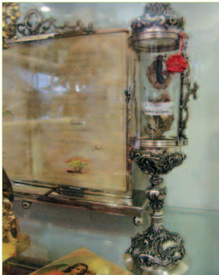
Relics of St. Gemma Galgani

It is the sole right of the bishop, not of other local ordinaries or religious - since it is not their area of competence - by their proper authority and in communion with the Holy See, to guarantee the authenticity of relics and how they are managed. In the case of canonical recognition of the mortal remains of a saint, as well as their removal to a place other than that church where they are pre-