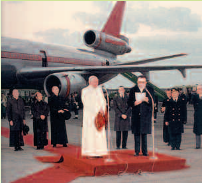
John Paul II - Visit to Mexico

“Do not be afraid to open the doors to Christ”