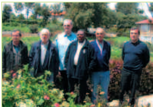
General Consulta in Kenya

Convinced of the fact that information about the Synod and its decisions for all the religious is a given essential for the commencement of