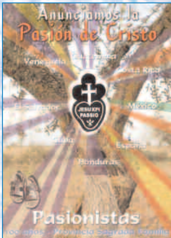
Centenary Poster of the FAM Province