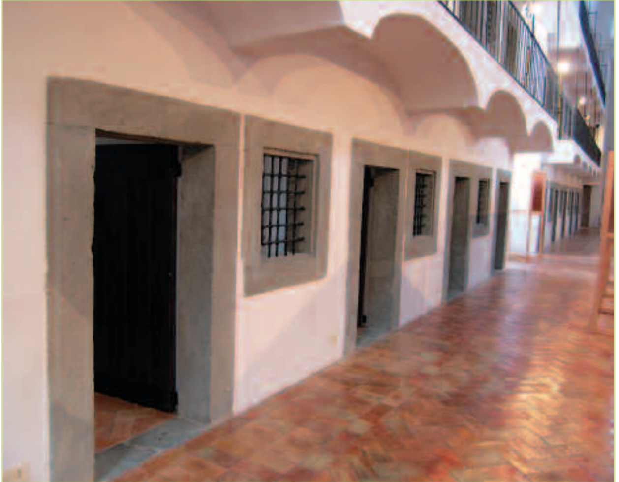
The interior of the prison for juvenile offenders