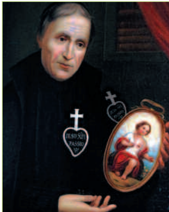
Blessed Lorenzo Maria Salvi, C.P.