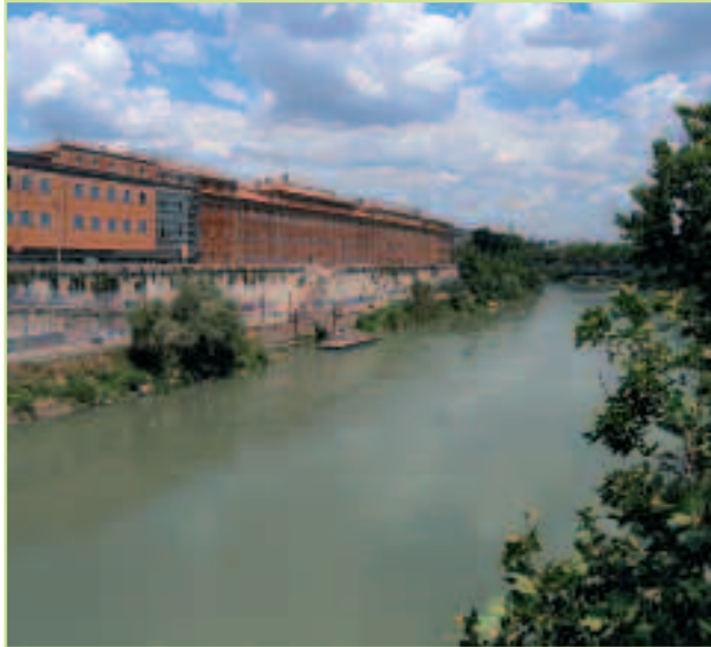
The complex of the Hospice of San Michele

Sundays to those in solitary confinement, i.e. those in small cells with little lighting. During some years all would receive the sacraments. In 1854 the Passionists preached retreats lasting three days to incarcerated politicians, and about 150 went to Confession and Communion. In 1855 there was "a general Communion by everyone". In 1864 the two preachers remained for dinner in the convent of St. Gerolamo della Carità. In 1886, although the administrators themselves were being investigated, and were therefore uncertain and agitated about the sentence of the court, nevertheless many went to Confession and Communion.