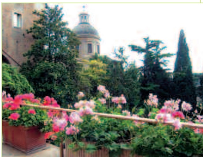
The cupola of the Chapel of St. Paul of the Cross, Rome

For example, is there an assumption about Passionist community life, i.e., that there is only one way of being a Passionist community? What if that one way is no longer life-giving, or in fact, drains the energies of its members and the resources of the Province? Or what if a particular mission requires a different way of coming together? Must we always live in the same physical space in order to be a community, or can we commit ourselves to gathering "intentionally" at regular times for faith-sharing, prayer, mutual support and a meal? Are there other models of common life that are supportive and nurturing while, at the same time, allowing space and time for both a particular mission to the Crucified and contemplation? Of course, these models are already operative in many parts of the Congregation.