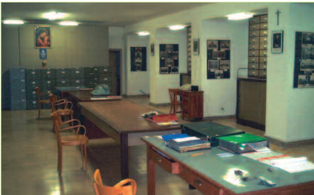
The General Archives

Remember that anytime you are in Rome, you are more than welcome to visit the General Archives and experience all the wonders of the past and present history of our Passionist Congregation.