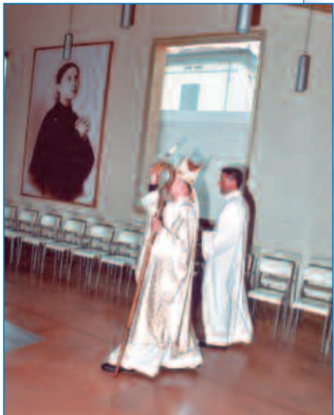
The blessing of the new Pilgrim Center