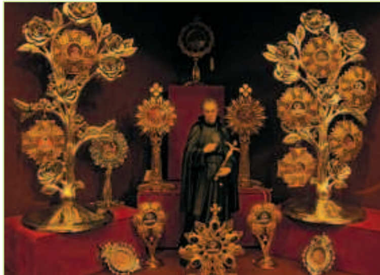
Relics prepared by the General Postulation

the same the same Congregation (of the Causes of Saints) is left the decision regarding all matters concerning the authenticity and the conservation of relics." 3