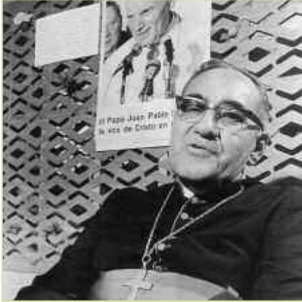
Archbishop Oscar Romero

"No set of goals and objectives includes everything"