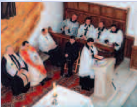
Celebration in the Passionist church of Wisla, Poland