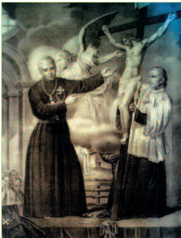
An antique print of St. Paul of the Cross