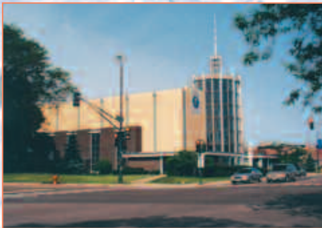
La parrocchia dell’Immacolata Concezione