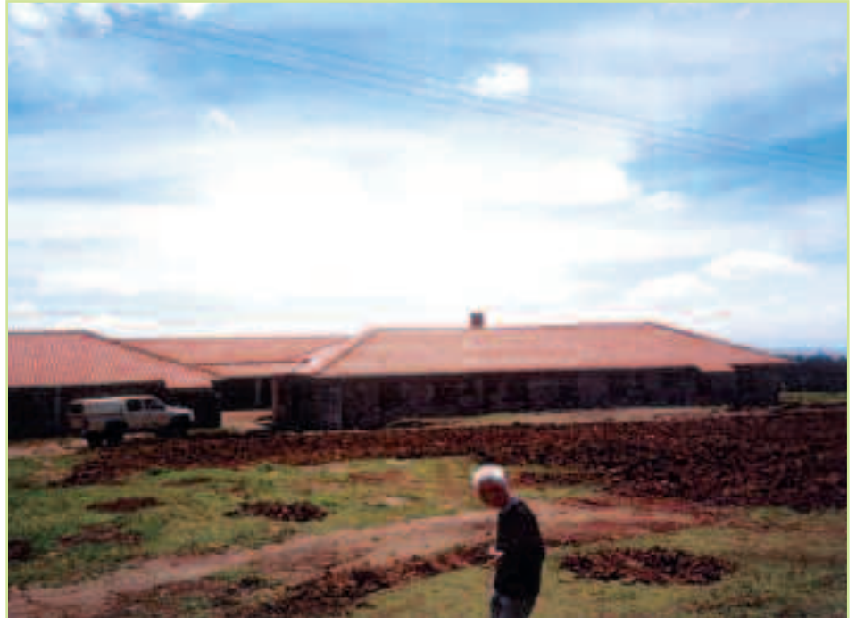
The new house of the CARLW Vicariate in Molo, Kenya

This situation brings us to the conclusion that