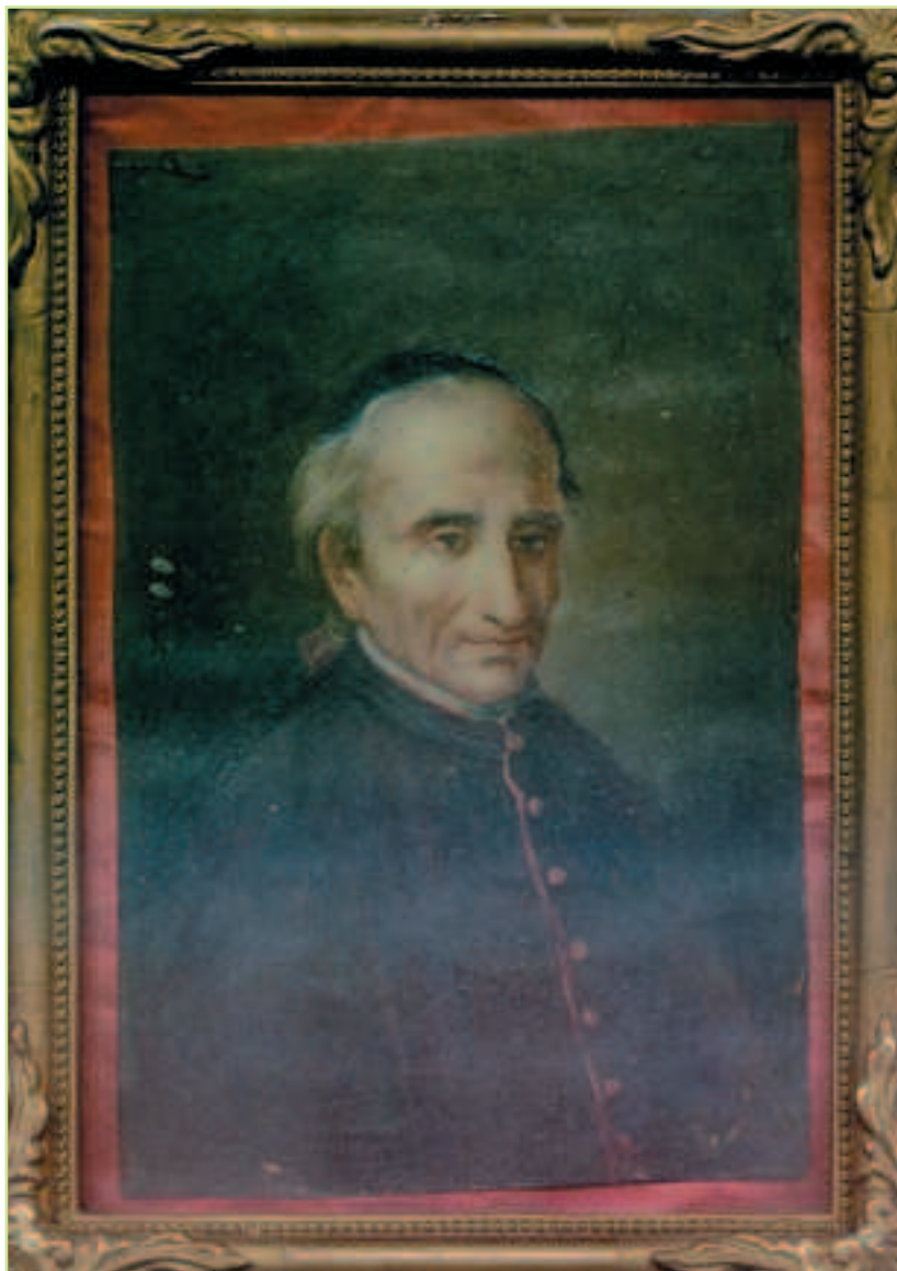
Antique portrait of St. Vincent Mary Strambi

As was stated at the beginning of this article, this assistance that we offer is one way of fostering interest in our history and spirituality.