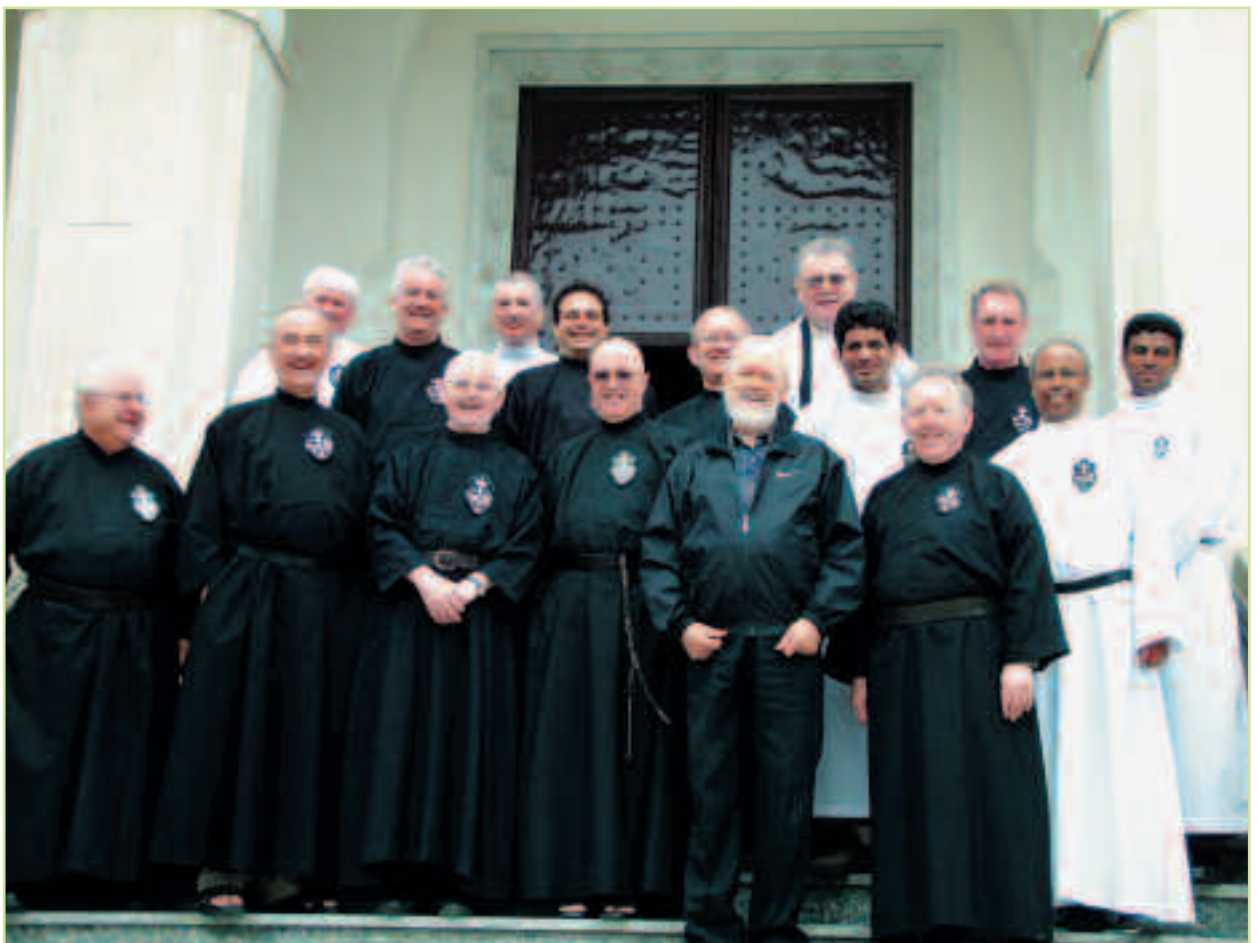
Foto of the group at Ovada

Our Provincial Council has determined that we need to provide opportunities for more members of our Province to acquire a better appreciation of our history and spirituality. With increased knowledge and experience, it is our hope that these men can be a resource to enrich others, both professed and none professed, who are clearly expressing a yearning and love for Passionist spirituality.