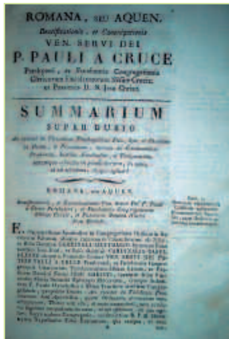
The first page of the “Positio” of St. Paul of the Cross

Finally, on 25 Jan. 1983, John Paul II promulgated the apostolic constitution Divinus perfectionis Magister (= DPM), published in the Acta Apostolicae Sedis (AAS, 4 [1983], 349-358). The Congregation for the Causes of the Saints (=CCS) on 7 Feb. 1983 published the Normae servandae in inquisitionibus ab episcopis faciendis in Causis