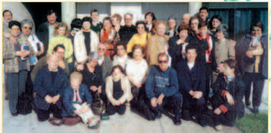
Group foto at the XXXV National Convention