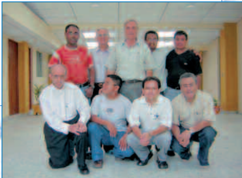
The new foundation in El Salvador

Additionally, the community for the study of Philosophy of St. Gabriel, which belongs to the Mexican Vicariate of Our Lady of Guadalupe, has taken up residence in its new house. It is located in the city of Guadalajara, Jalisco State. This residence was built to house Philosophy students and the postulants of the Vicariate.