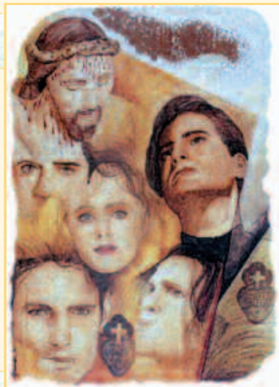
The logo of the “Festa”