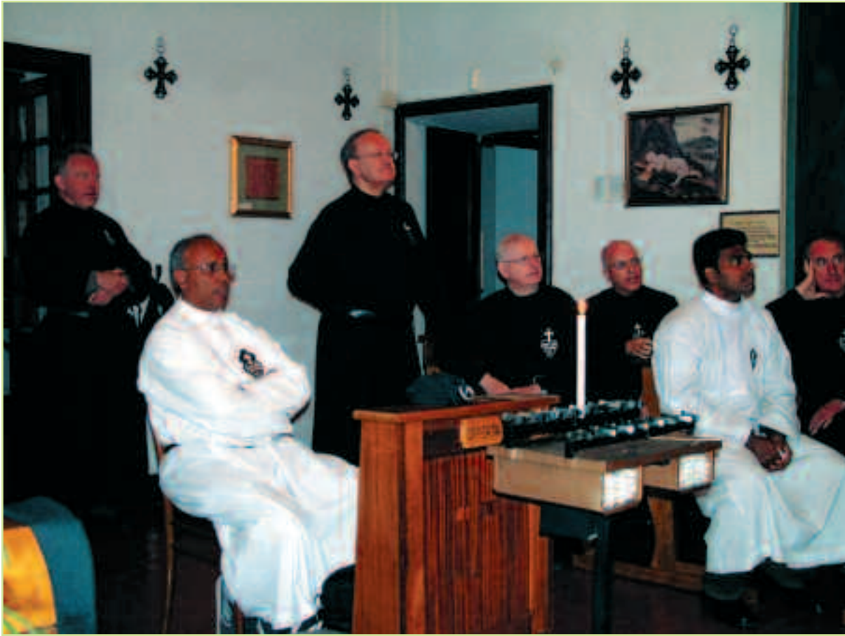
A moment of prayer at Ovada, in the house where the Founder was born

We live on the other side of the world from where Paul Danei lived. Our religious and secular culture is vastly different from that of Italy. Indigenous Australians have inhabited our land for more than 40,000 years, but much of their spirituality and culture has been obliterated, since Western colonization began in Sydney in 1778, three years after St. Paul of the Cross died. New Zealand has been inhabited by Maori and their ancestors for more than 700 years. Although Maori and other Pacific Island spirituality is still very much alive, it is a minority culture and vastly different from that of Western Europe in the eighteenth century.