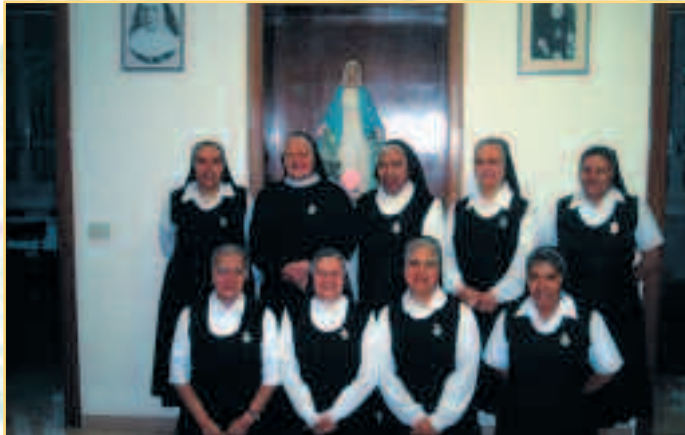
The Community of the Sisters, Daughters of the Passion in Rome