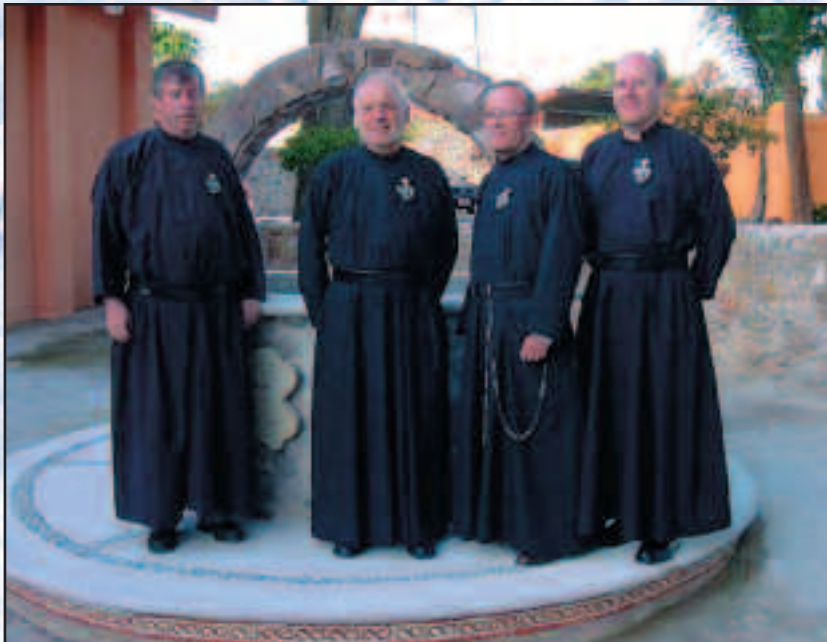
The new Curia with the Superior General