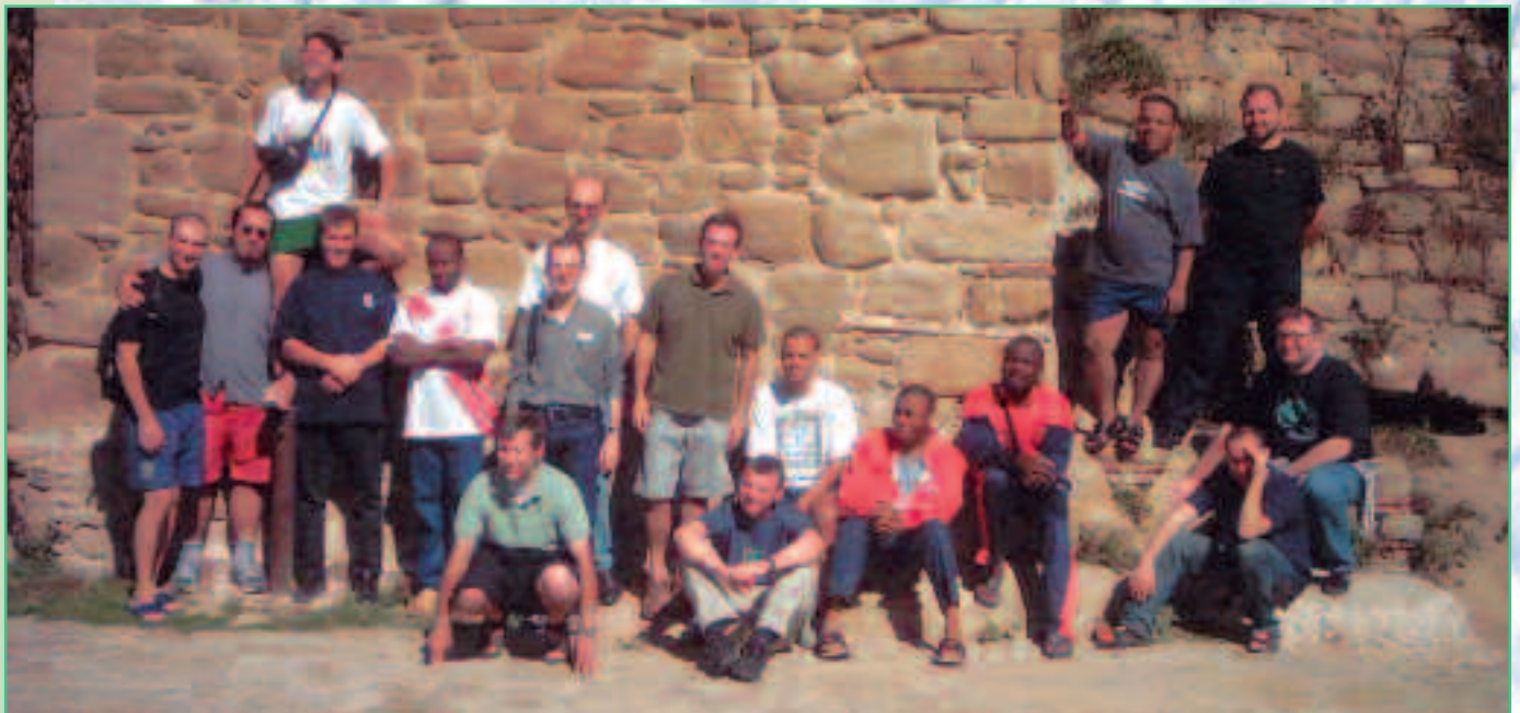
A group of young Passionist students

For the second consecutive year a course for young religious and priests was organized by CIPI (Inter-provincial Conference of Italian Passionists) for the purpose of affording the young Passionists of the Italian Provinces the opportunity to gather together and reflect on topics pertaining to aspects of Passionist community life and pastoral ministry. This year the meeting took place in the community of Fuscaldo (LAT – Frosinone) and chose as its central study topic that of the dynamics of communication and its relation to the Memoria Passionis .