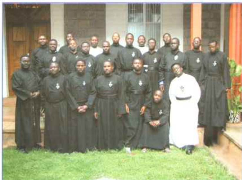
Students of Kisima, Kenya

All four Vicariates are very active in the area of vocation promotion, a sign of vitality in this part of the Congregation. Each Vicariate is making some choices for the growth of the Congregation on the level of personnel as well as material goods. Each Vicariate tends to be autonomous and is an entity that is legally recognized in the Congregation. Currently, for example, the Vicariate in Tanzania is zealously working to find funds to ensure local self-sufficiency and it is succeeding by 50%. By contrast, in the Vicariate of the CONGO-SALV, despite the good will of the religious and all the efforts that attempt to resolve this situation, because of the politics and the economy it has not succeeded in bringing the plans for self-sufficiency to fruition. For the Congo it is an unfortunate situation, because the Vicariate is preparing to assume the status of a Vice-province next year. It is a situation in which, the Province, the Vicariate and the central government are busy trying to find solutions. The Vicariate in Kenya instead is working to bring about profound changes, so as to progress from being a mission to a foundation of the Congregation. It, too, is trying to