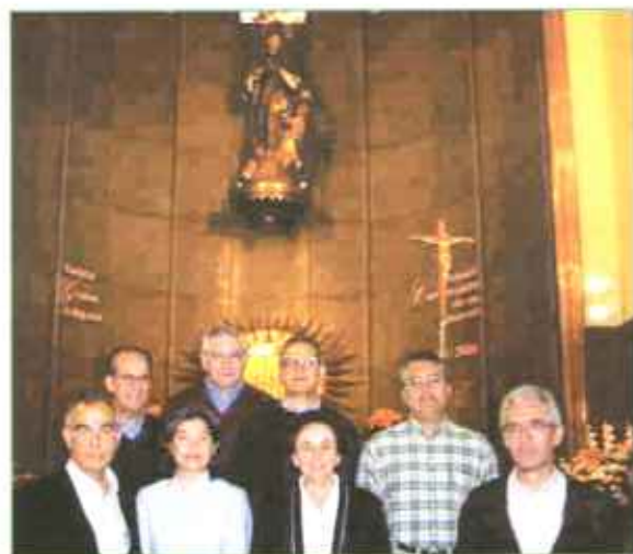
The participants at the recent meeting of CII

order to realize the phases of Aspirancy and Postulancy (including Philosophy) in each area of the province, the Novitiate on a Provincial level in Spain integrated with that of CII, the theology would be divided in two, one for all of the students of the Province in America, possibly in El Salvador, and the other in Spain, integrated with the CII.