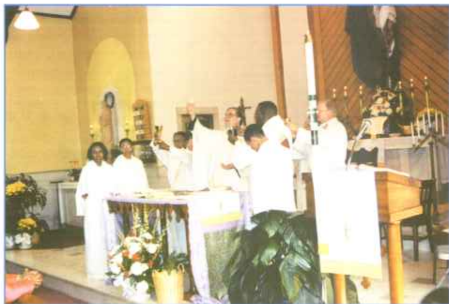
Birmingham, Alabama: Eucharistic celebration in our parish

The schools that have around 500 boys and girls are an example of the possibility for dia-