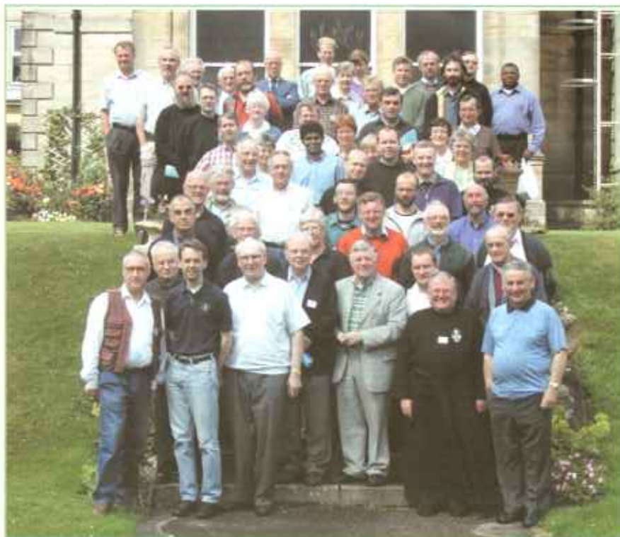
Minsteracres: foto of the group of participants

"Passages and places of safety" seemed to be a recurring theme. Is this the song of the Passionists in North Europe - providing places and passages of safety for those who do not feel welcome within an affluent society or who cannot find their way within the structures and restrictions of an institutional Church that is now foreign to them? I could not help but think of that now famous picture of our habited Father Aidan Troy , C.P. shielding and walking with the children in the midst of a rejecting mob. Are we called not to "fix" but to "accompany" the Crucified?