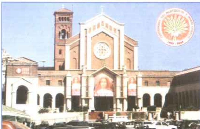
The Sanctuary of Nettuno

summer rest in order to grow spiritually, I entrust the youth to Mary, shining with beauty. She, who sustained Maria Goretti in her trial, helps everyone, especially adolescents and children, to discover the value and